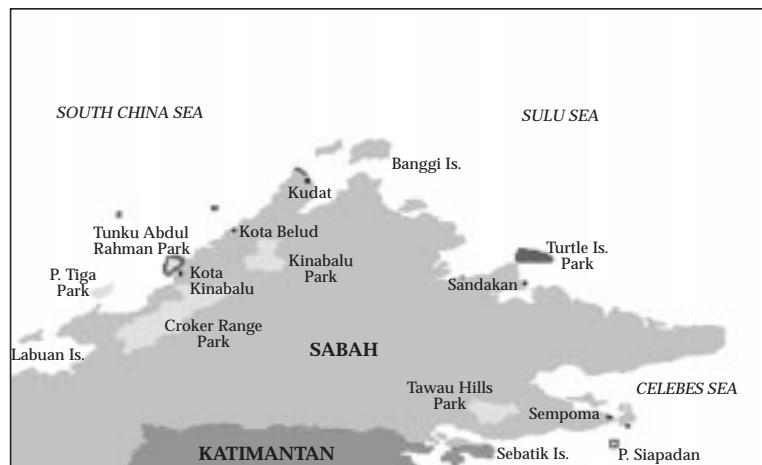
Map 2. State of Sabah in Northeast Borneo