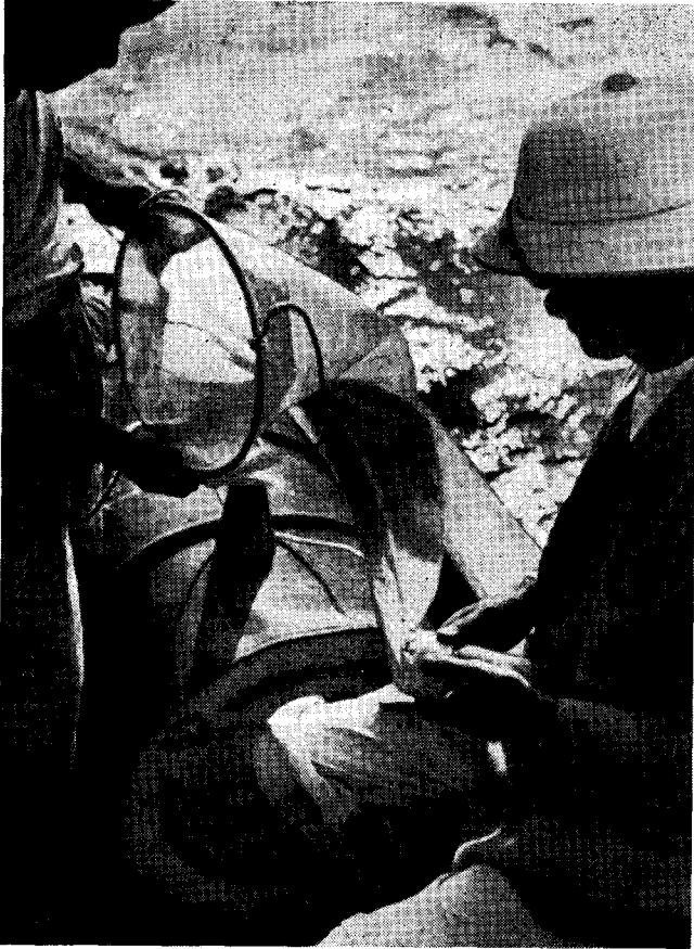
The author, with native assistant, preparing to shoot a plankton net in Hikueru Lagoon.

Once rich in pearl oyster beds, many lagoons in French Oceania have become exhausted due to over-exploitation by man, and to natural causes. Practical measures to restore their productivity are detailed in this article.