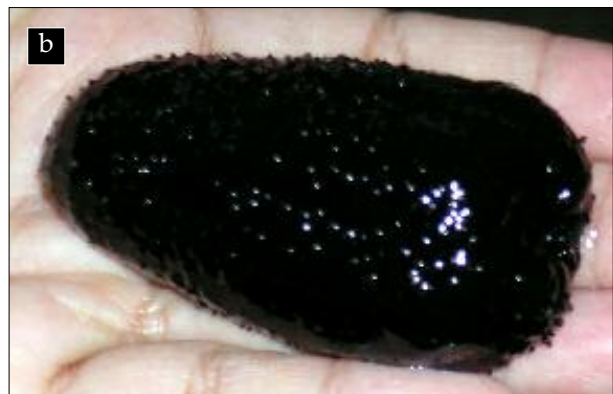
Figure 2. Result of inducement (a), and P individuals (b) of Holothuria atra .