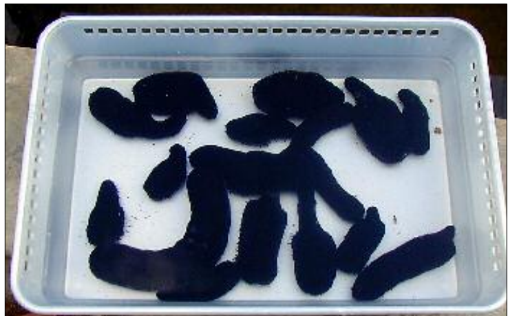
Figure 3. Regenerating individuals of Holothuria atra : 4 weeks after fission (left) and 9 weeks after fission (right).