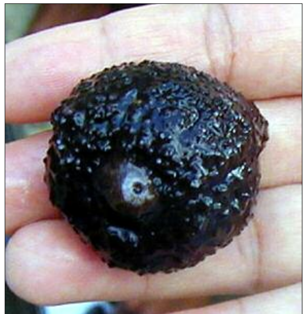
Figure 4. Regenerating individuals of H. leucospilota . New mouth part (left) and anal aperture (right), 9 weeks after fission.