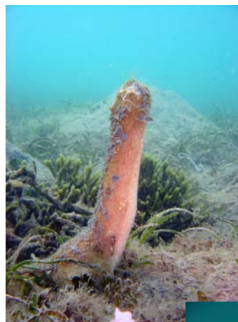
Spawning Bohadschia similis