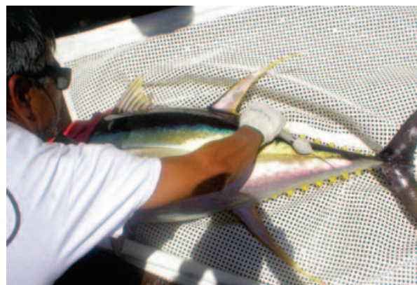
Satellite tagging of a 90-pound yellowfin tuna.

Tagging and tracking studies show that most yellowfin tuna do not leave Hawaiian waters throughout their lifetime.