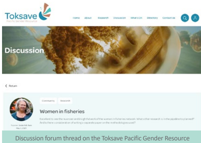
Discussion forum thread on the Toksavé Pacific Gender Resource