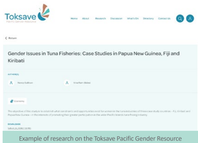
Example of research on the Toksavé Pacific Gender Resource