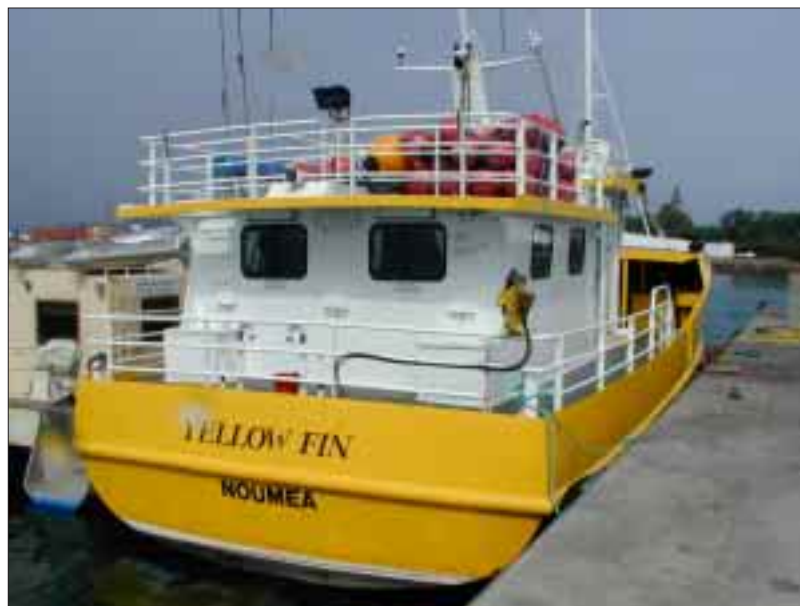
Figures 2 and 3: F/V Yellowfin