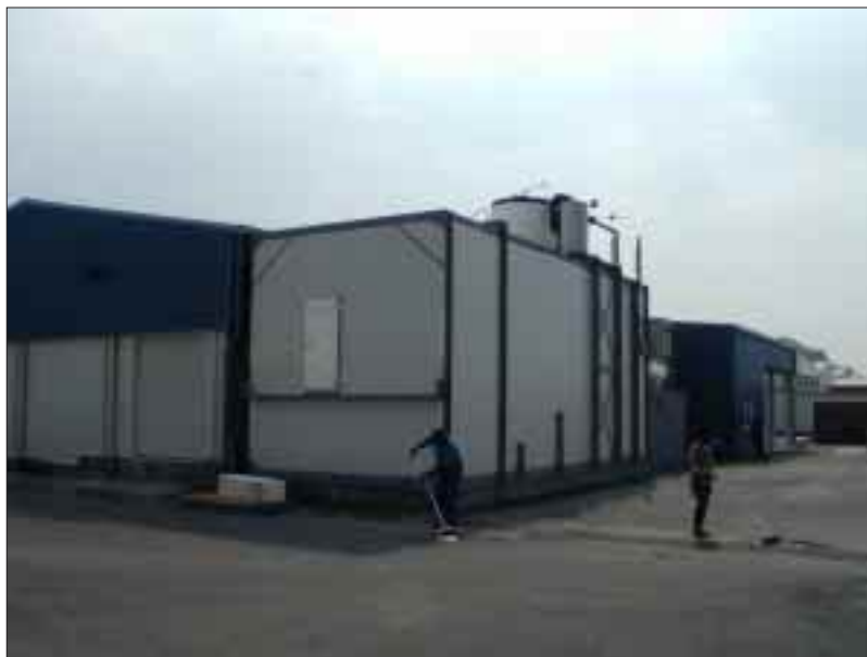
Figure 9 (top): Pescana's gel ice machine