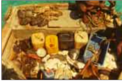
A multi-species catch by Brooker people aboard a local fishing vessel at the Long/Kosman Reef. On the floor you can see the white mantles of several T. gigas