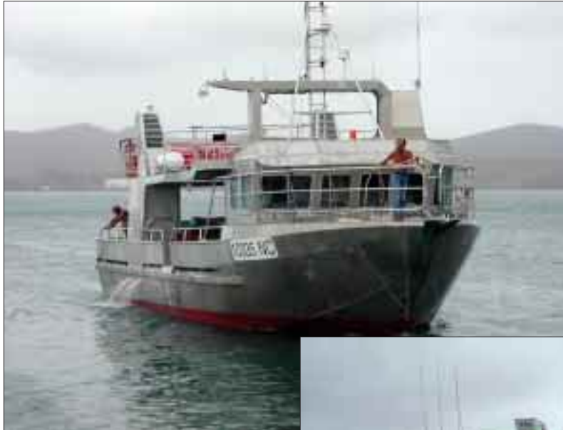
Figures 11 and 12: F/V Warren