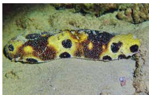
Bohadschia subrubra from Mayotte.

The aim of this work is to shed light on echinoderms in some classical works like Richmond 2011 (Guide to the al. 2016 (Oursins, étoiles de mer et autres échinodermes : ecological, behavioural, taxonomic and cultural information followed by a research paper in English.