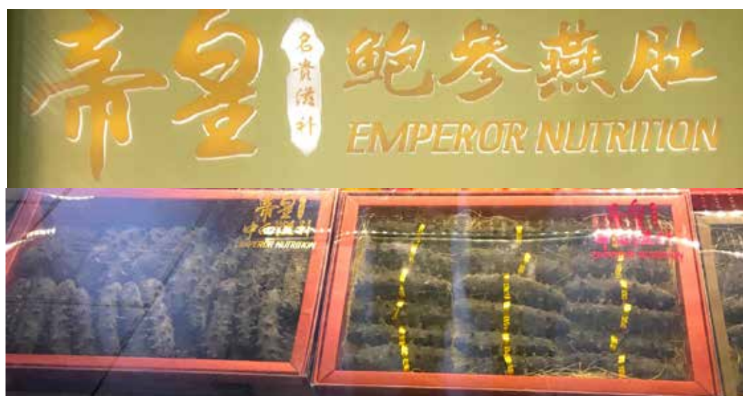
Figure 2. A shop in Melbourne, Australia selling boxes of dried sea cucumbers.

Many different species of different origins are presented in a shop (Fig. 2) where photos were not allowed to be taken, but the prices were advertised as AUD 300 for a species sold as teatfish (certainly Holothuria fuscogilva or H. whitmaei ) and AUD 200 for Thelenota ananas . There were also many Apostichopus japonicus , Holothuria scabra and other species. Most products were dried, but some were frozen.