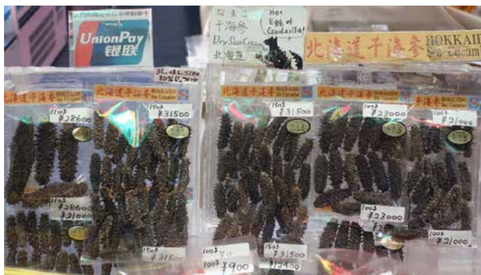
CIEC - Sea cucumbers sold in Nishiki food market de Kyoto, Japan.