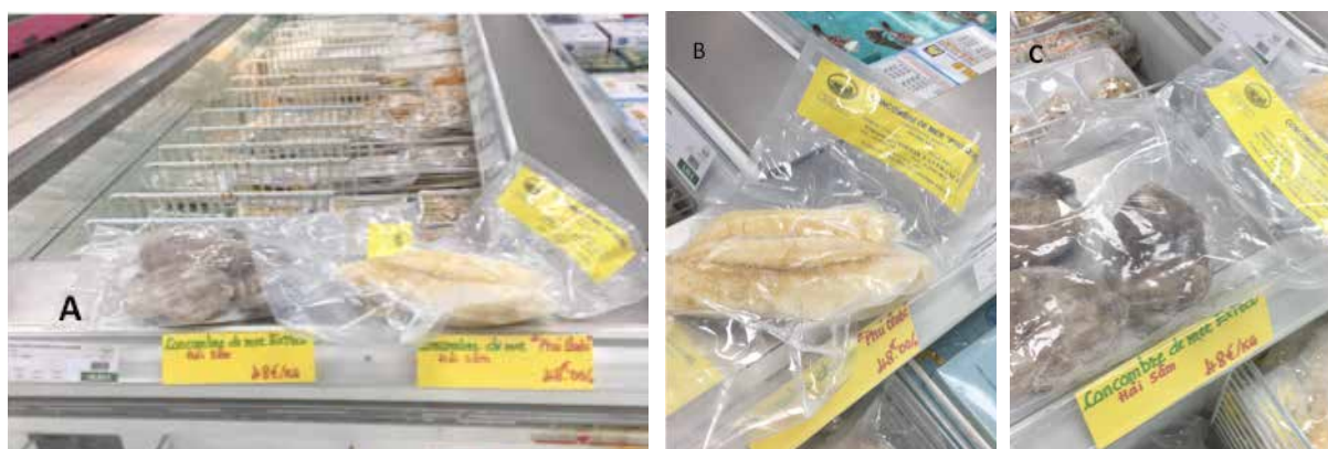
Figure 1. Frozen sea cucumbers from Viet Nam found in a Paris market.

Frozen sea cucumbers from Viet Nam can now be found in Paris (Fig. 1A) at a price of EUR 48 kg -1 . The identification is incorrect, as the sandfish Holothuria scabra does not look like the ones presented here (Fig. 1B) and H. vagabunda is not a valid scientific name (Fig. 1C).