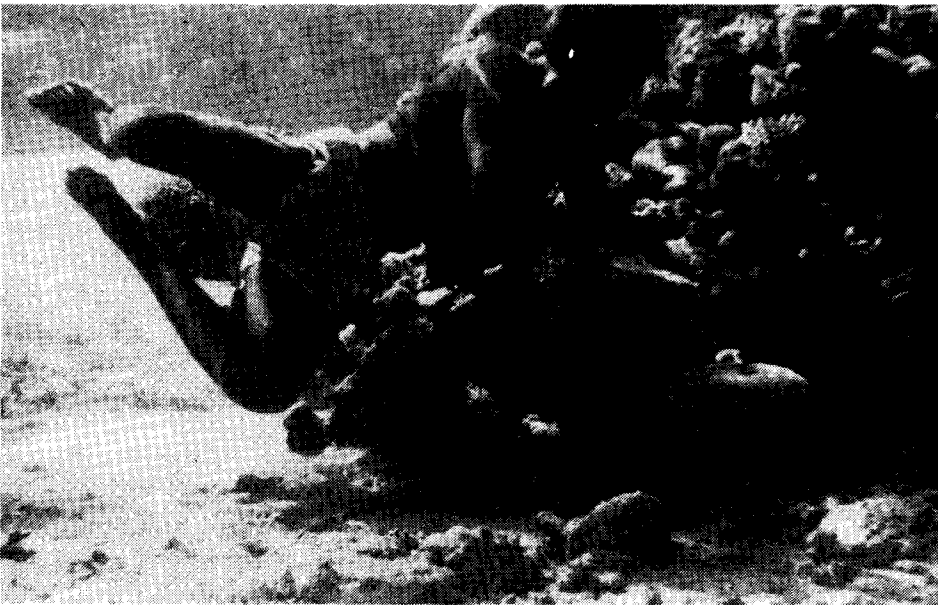
A Fijian diver dives for bêche-de-mer in the Lau Islands.