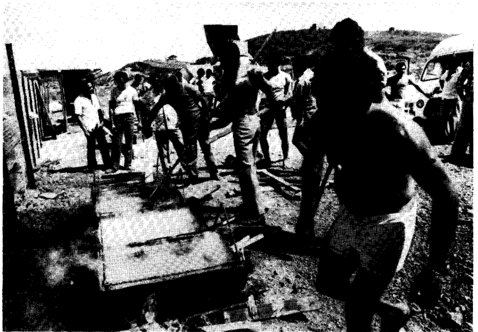
The boiling stage during the processing of bêche-de-mer.

Processing bêche-de-mer involves cleaning and drying them. The bêche-de-mer are first boiled and gutted, then dried for about 36 hours in a smoke drier and finally dried in the sun. They are then packed in sacks ready for shipment. The technique is not difficult, but care is required at all stages so that the final product is neither soft nor misshapen,