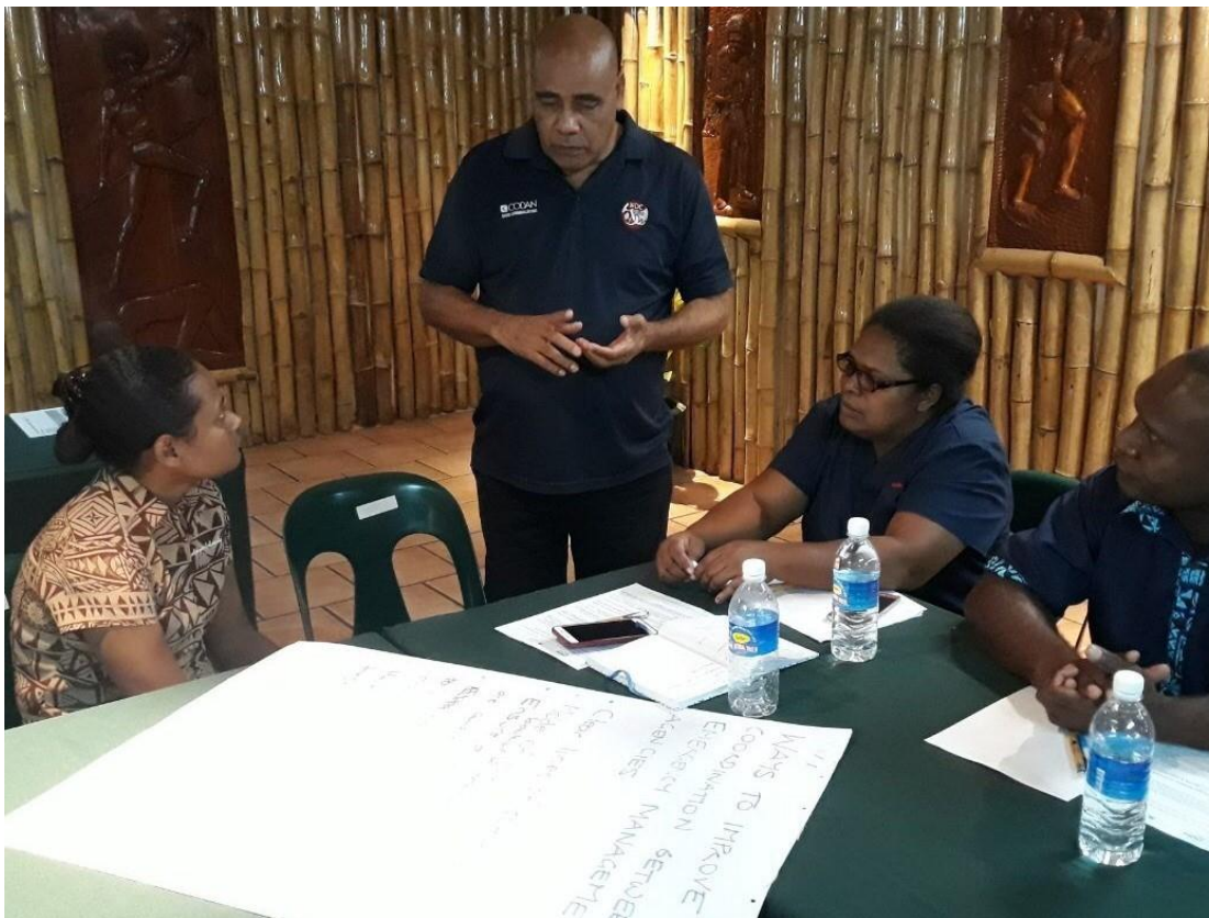
Figure 1 - Emergency Management Roadmap pre-development consultation in Solomon Islands, May 2019