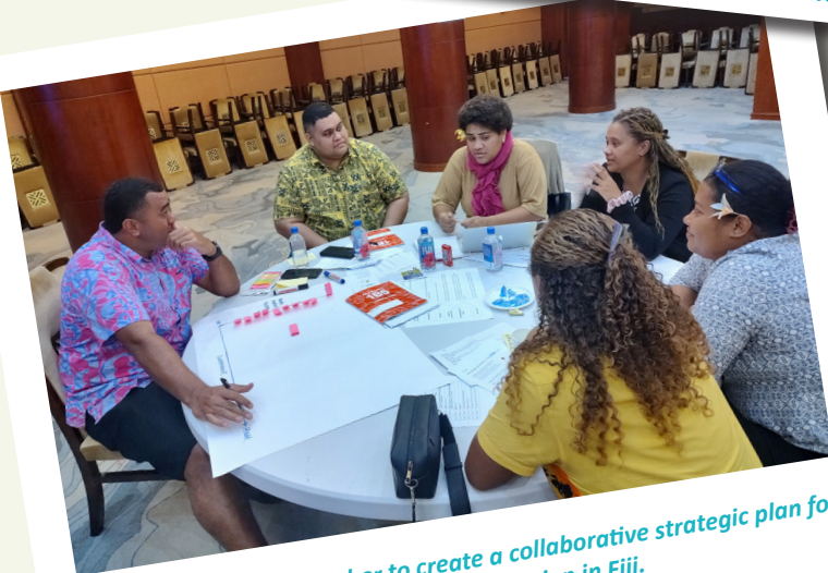
Participants work together to create a collaborative strategic plan for combating disinformation in Fiji.