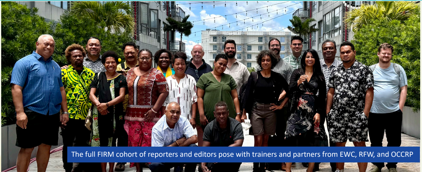
The full FIRM cohort of reporters and editors pose with trainers and partners from EWC, RFW, and OCCRP