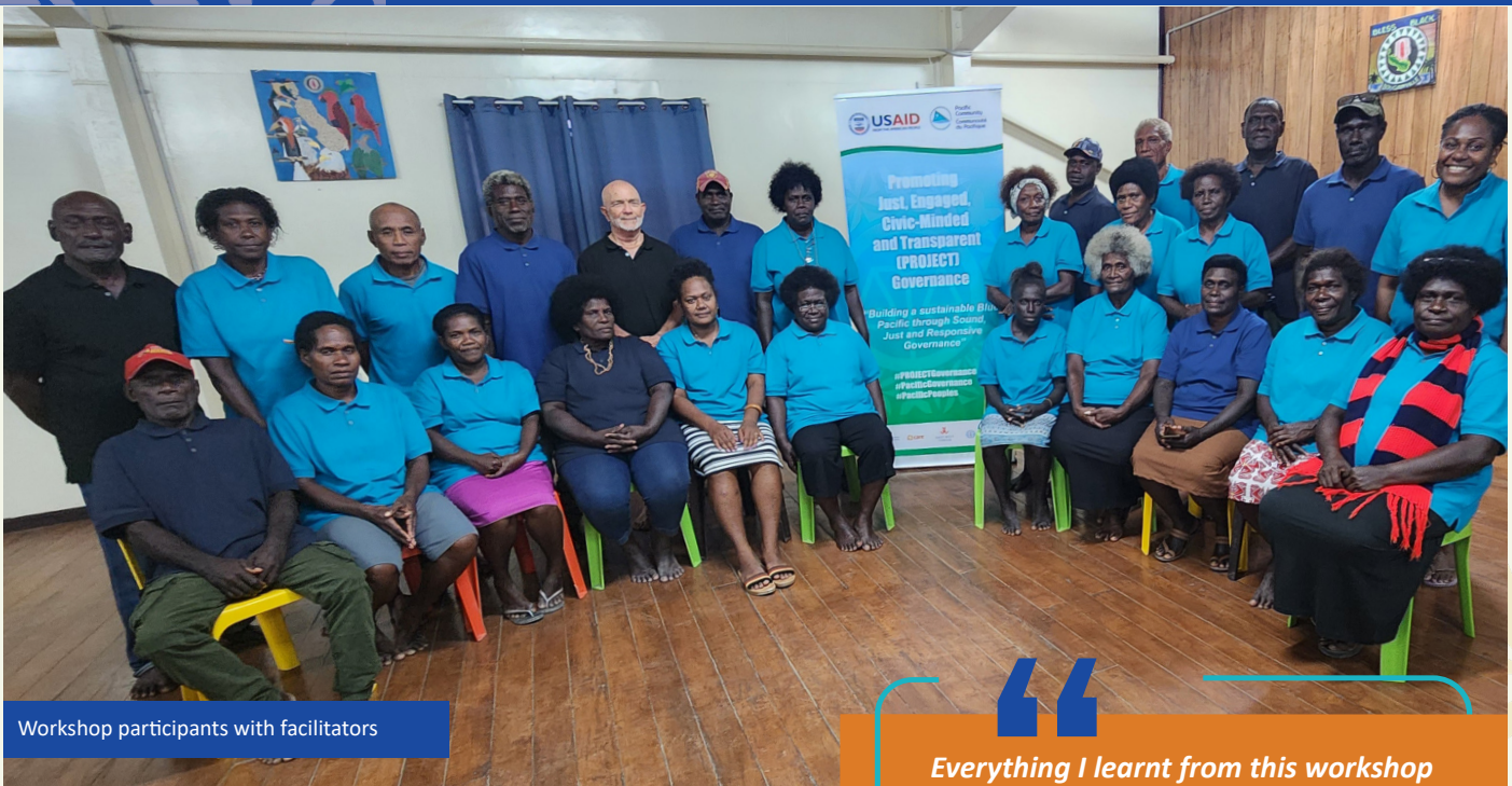
Workshop participants with facilitators

Everything I learnt from this workshop makes me feel confident and more interested because as a leader, I must help us work as a team and respect each other.