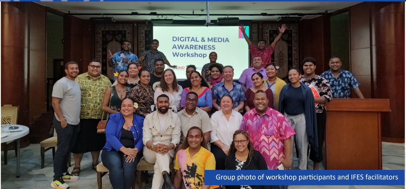
Group photo of workshop participants and IFES facilitators