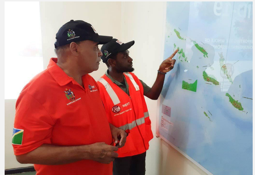
Caption: The SREM has in part been developed based on a recognition of the new and emerging emergency management capabilities in the region. It will build on existing and support development of new initiatives. Images: Left: Mobile field hospital deployed in Suva, Right: Solomon Islands NERT members