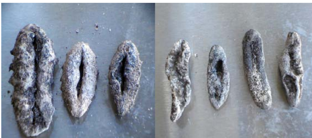
Figure 2. Poorly processed sea cucumbers for export from Fiji Islands.

Ways to add value to beche-de-mer products exported from Fiji Islands should be investigated. The reduced grade in the final product has also prompted immediate awareness by and education for fishermen to improve processing methods and quality of beche-de-mer in Fiji Islands.