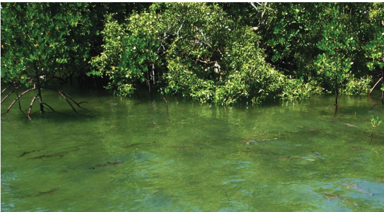
Figure 1. Blacktip reef sharks are sometimes seen aggregating in murky waters in coastal habitats such as mangroves, seagrass beds and coastal mudflats. These sharks were photographed in Cockle Bay, North Queensland.

The main pressure facing reef sharks in the Pacific is fishing. However, sharks and rays can also be affected by habitat loss, as important feeding and breeding grounds are disturbed by pollution and/or coastal development. Destruction of these habitats disrupts breeding cycles