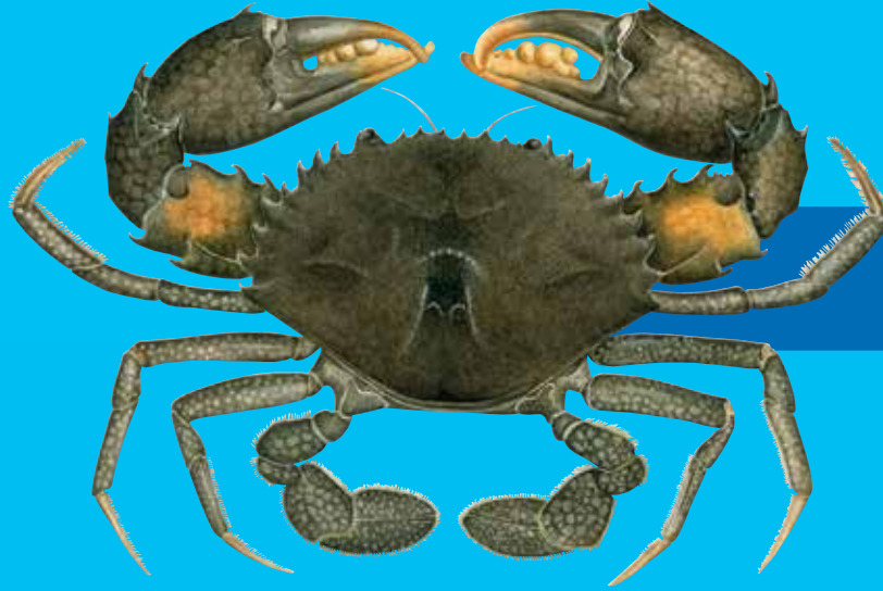
Krab kaltoni Mangrove Crab ( Scylla serrata )