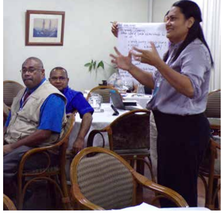
Regional SREM Consultation, Feb, 2020