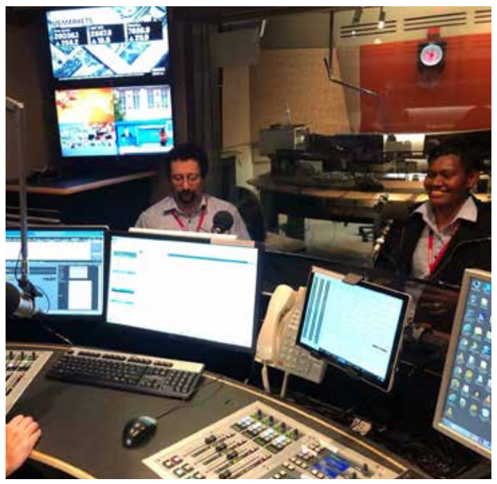
Radio interview, AFAC19 - Melbourne Aug 2019