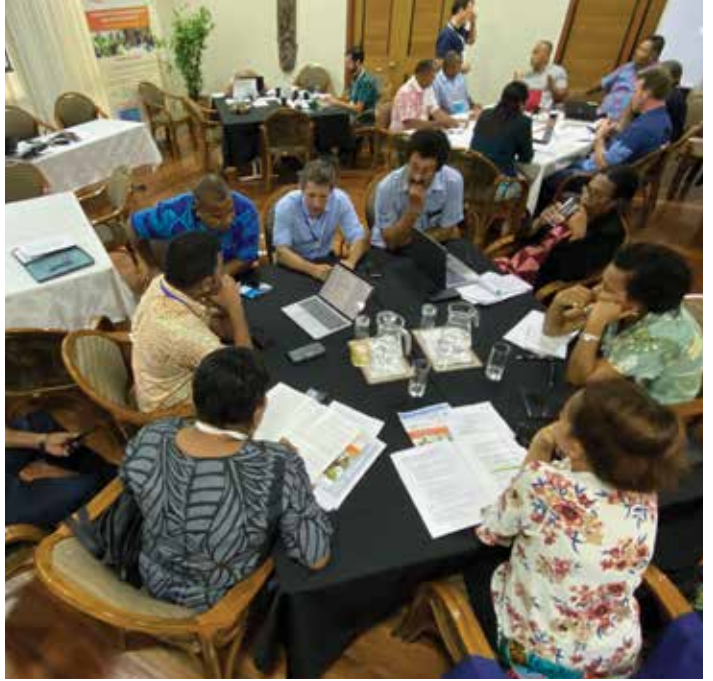
Regional SREM Consultation, Feb, 2020