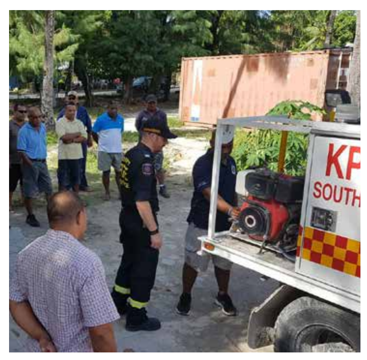
Kiribati Mechanical Training with Kiribati Police (Fire) Service Nov 2019