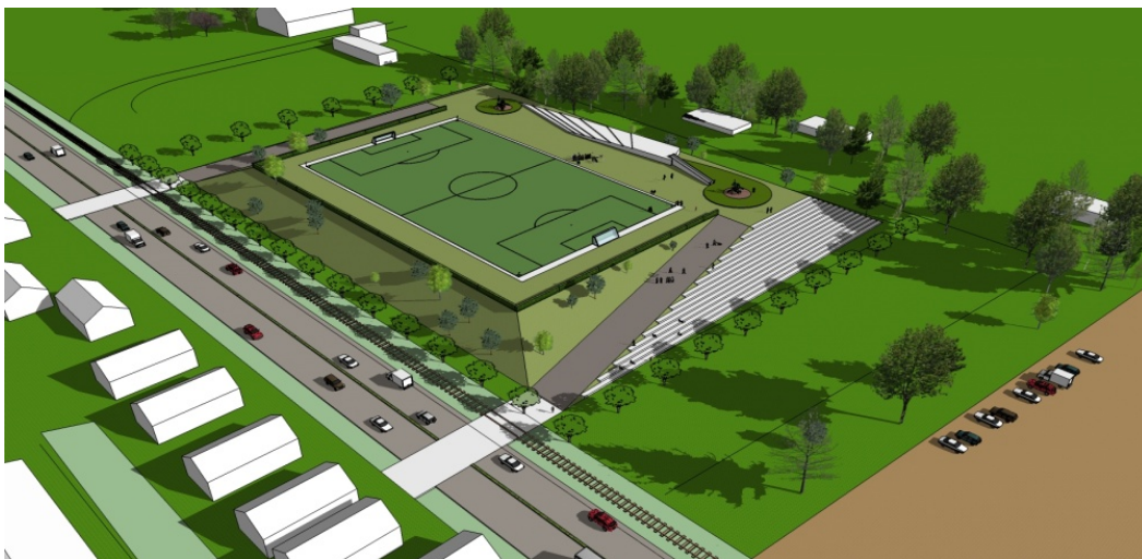
Prototype Tsunami Evacuation Park in Padang, West Sumatra, Indonesia

Chaired by the Government of the Cook Islands at the Edgewater Resort, Rarotonga, Cook Islands