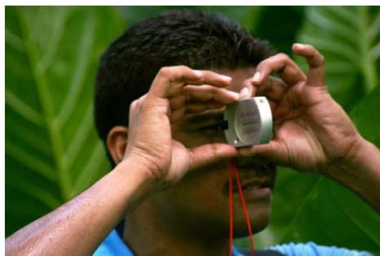
Measurement of palm height with clinometer, field work in Pohnpei

Various pilot projects in the Pacific region have shown that coconut oil can replace diesel oil in power generation and, to a limited extent, in transport applications. While the economics of using coconut oil as a substitute fuel are often marginal 1 , its use as a niche fuel (in remote island locations with high transport cost for both inbound fuels and outbound copra or coconut oil are high) and its potential to enhance energy security in case of an energy crisis and subsequent supply interruptions are undisputed. The results of the Asian Development Bank trials in Solomon Islands and experiences of the power utilities of New Caledonia and Vanuatu have clearly shown that the use of high quality coconut oil is technically feasible in well-engineered equipment operated by properly trained staff.