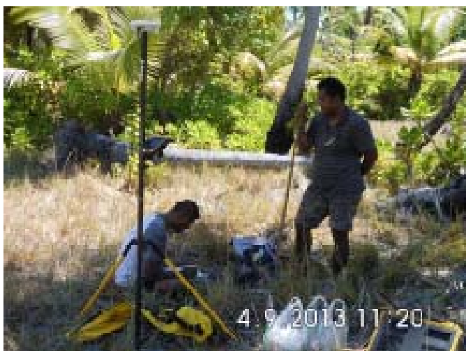
Figure 2: Base station of 80 cm accuracy GPS, field work in Kiribati

The coconut palm fertility is currently estimated through sample plots where the numbers of coconuts of the three oldest branches are counted and the average is multiplied by 12. This method still needs verification in the Pacific.