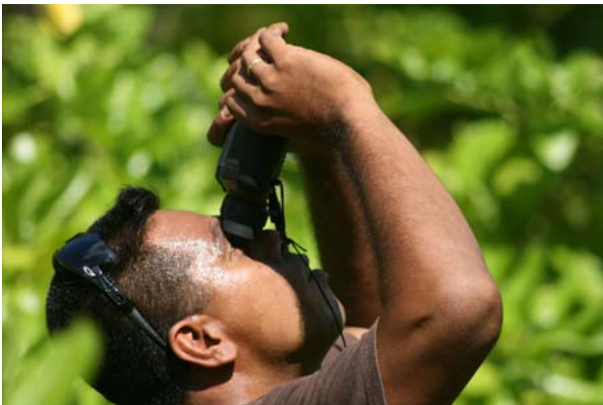
Figure 1: Counting coconuts of the three oldest branches with binoculars, field work in Kiribati

The area of the coconut palm cover is the most essential information to estimate the resource, where the area has to be stratified into different densities. Currently, this is carried out in three strata (i) scattered 25 to 50 palms/hectare, (ii) medium dense 51 to 150 palms/hectare and (iii) dense above 150 palms/hectare. Having the area per stratum, the number of palms can be identified with a known statistical error.