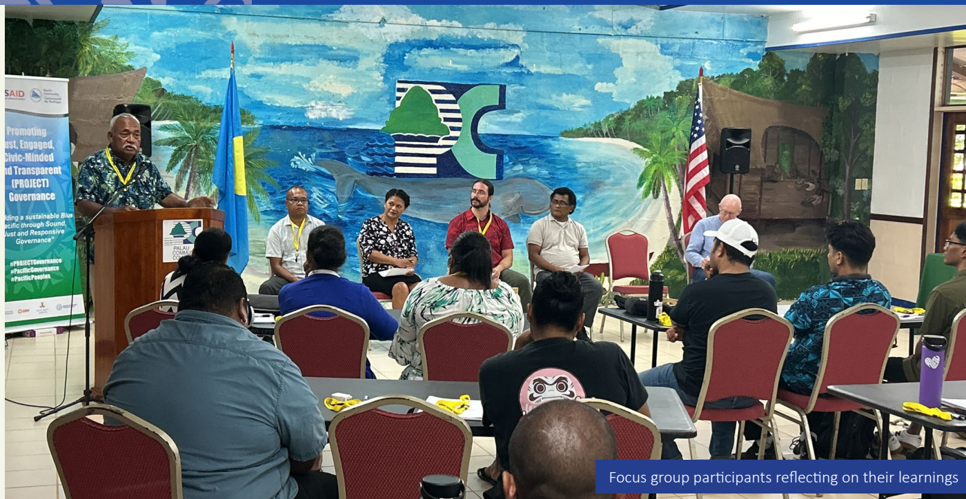
Focus group participants reflecting on their learnings