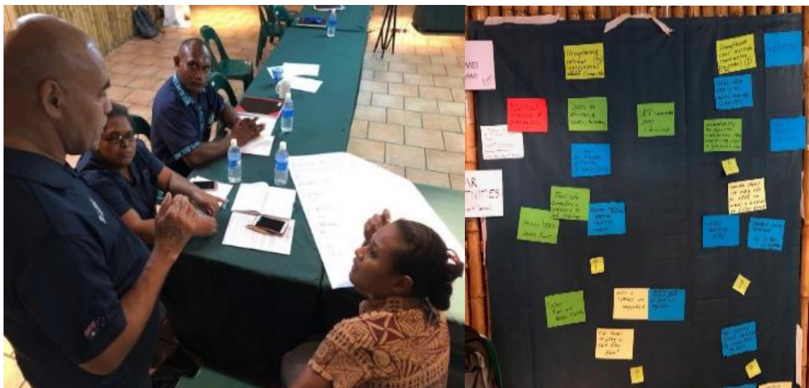
Image: The IMP consultation workshop brought together stakeholders for a hands-on and collaborative design process