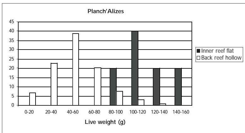
Figure 2. Live weight frequency distributions for Holothuria atra at Planch'Alizes site