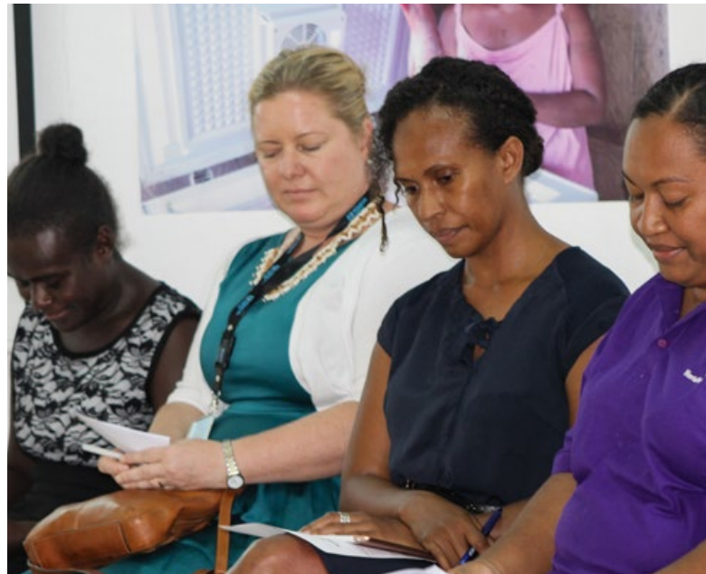
Panelists at the Women in Fisheries Forum - ©Chelcia Gomes, WorldFish.

Men tend to participate more in reef and offshore fishing, while women participate more in inshore areas such as lagoons and mangroves (SPC 2018). Gender norms and relations that determine what constitutes socially acceptable activities help shape these roles. In formal statistics, women’s contributions to fisheries – through gleaning and household