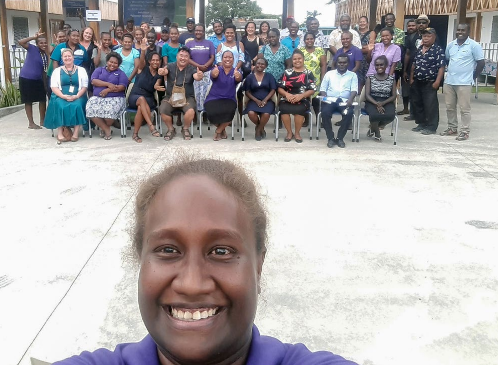
Participants at the Women in Fisheries Forum