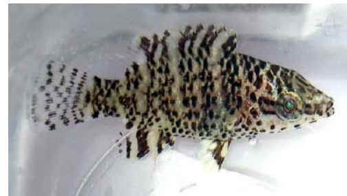
Figure 3. Napoleon wrasse hatchery-raised juvenile.