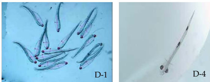
Figure 2. Napoleon wrasse larvae one day (D-1) and four days (D-4) after hatching.