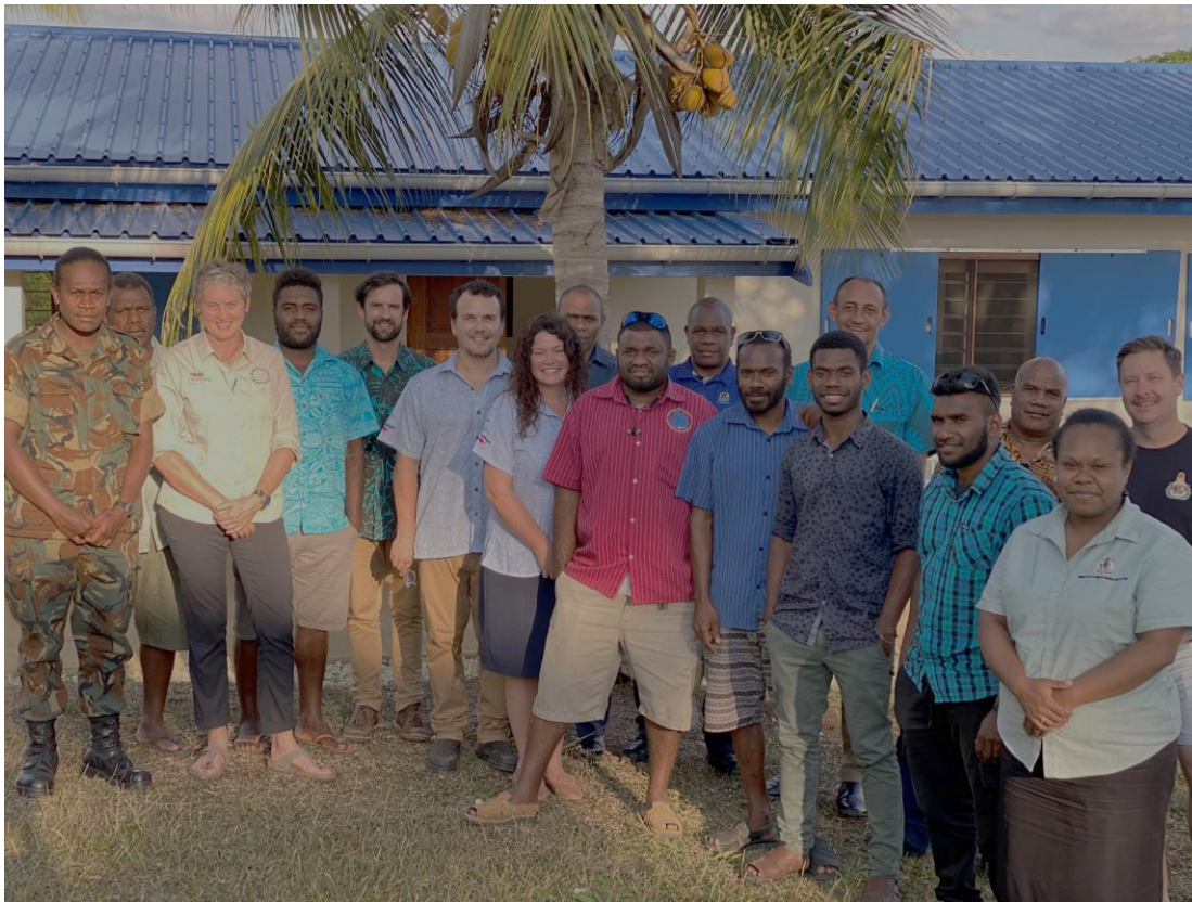
Participants of Vanuatu Strategic Roadmap for Emergency Management (SREM) consultation, Nov 2019