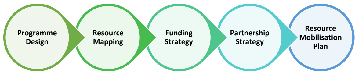
Figure 3. Five-step process for resource mobilisation

A five-step process can be adopted to identify and apply for relevant funding opportunities to support the programmes and activities of a national cultural organisation and to build partnerships and networks with other stakeholders.