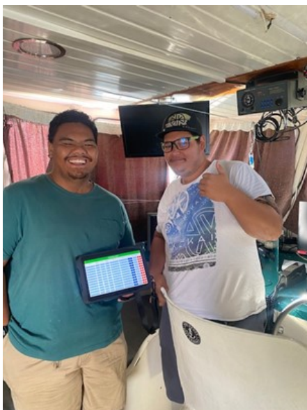
Figure 1. French Polynesia observer and Mokai 2 vessel skipper