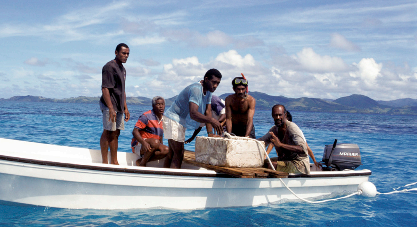
Waisomo villagers prepare to drop anchor for a buoy marking Fiji's first shark-focused marine protected area.