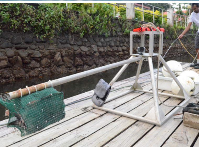
A baited remote underwater video (BRUV) system being prepared, Pacific Harbour, Viti Levu, Fiji. BRUV is a method of monitoring the marine environment by using bait to attract fish into the field of view of a video camera.

simple and practical tips for collecting scientific data. The absence of basic information continues to hinder better management, with many coastal fisheries lacking the necessary data to protect declining shark and ray populations and manage fisheries sustainably.