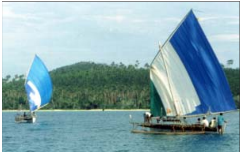
Figure 2. Sailaus in Deboyne Lagoon. (M. Smaalders 1997)

Growing populations, reduced government expenditures and expanding individual expectations are increasing the pressure on islanders to accumulate cash. At the same time, market prices for selected marine resources (such as beche-de-mer) are rising; and as a result, islanders are increasingly turning to them to earn cash. Stocks of some beche-de-mer species and other marine invertebrates are becoming locally scarce (Kinch 2001). Local exporting companies have begun offering credit schemes to islanders to purchase motorised dinghies. These allow islanders to venture farther afield in search of high value resources, to make more frequent harvesting trips (including when winds are absent or very light), and to harvest in previously inaccessible areas (such as those with particularly swift currents). As a consequence, over the last two to three years there has been a rapid increase in the purchase of dinghies. The outcomes of this ongoing technological change are as yet uncertain, but if dinghies replace sailing canoes as the primary means of transport, results are likely to include an erosion of traditional knowledge relating to canoe building and sailing, significant social and cultural changes, and an increase in harvesting pressure on commercial marine resources.