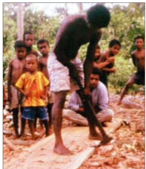
Figure 8. Initial work on planks is done in the bush with an adze.