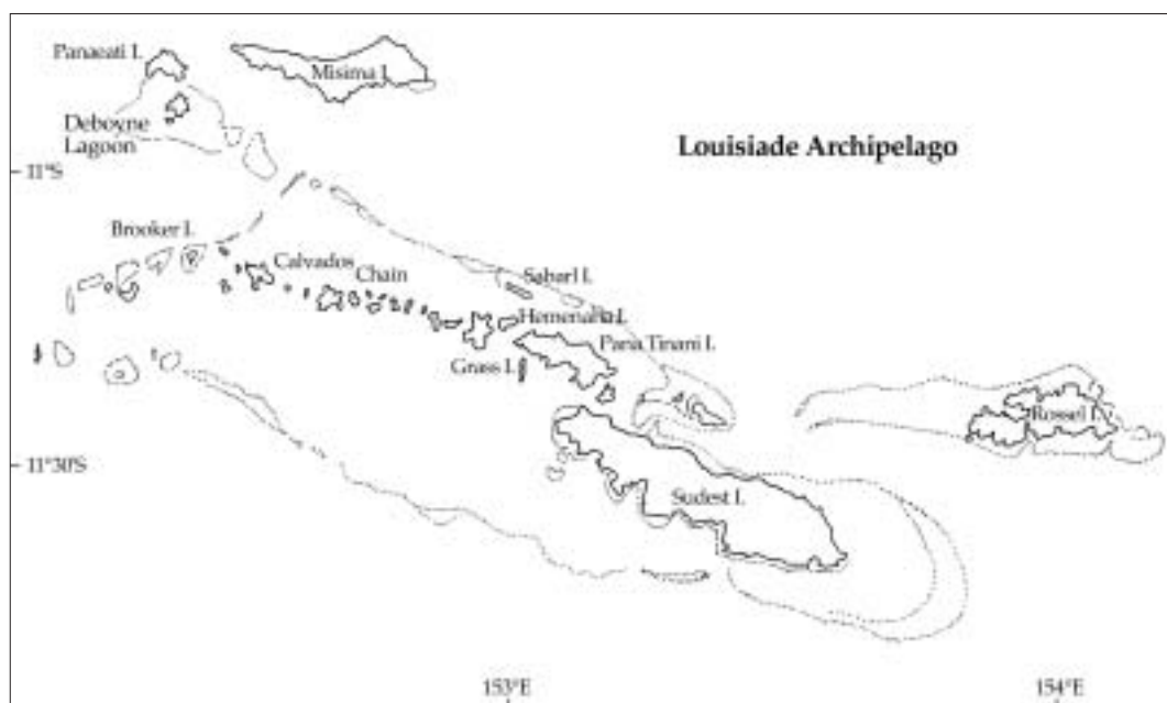
Figure 1. Louisiade Archipelago. (M. Smaalders)

Residents in the more remote islands of the archipelago (in particular the islands in Deboyne Lagoon and the Calvados Chain) rely heavily at present on sailing canoes ( sailau in the local Misima language) as a basic means of transport (Fig. 2). Sailing canoes are used to move between islands 3 , to transport goods and cargo, to access fishing grounds, and when engaging in trading, mortuary obligations and exchange 4 . The planked canoes vary in length from 4–12 m and carry a single outrigger. The larger canoes are substantial,