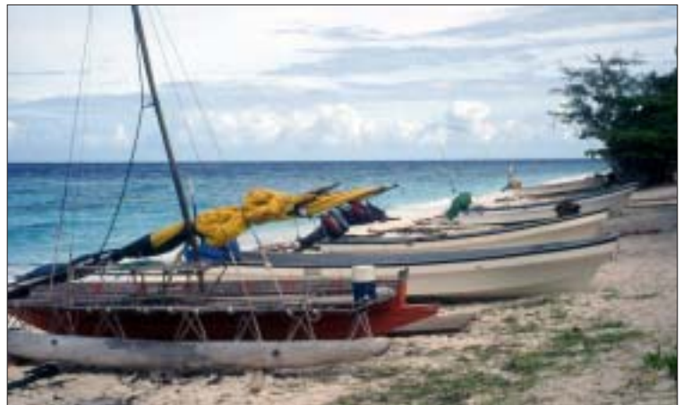
Figure 11. A sailau and motorised dinghies share the beach at Enivala (Punawan) Island.

As islanders' needs evolve, the specifics of the exchange networks and the goods traded have altered. Exchange continued and even expanded following pacification, despite disapproval by