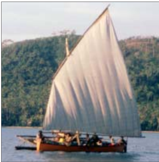
Figure 10. All Louisiade canoes are fitted with dipping-lug rigs. (M. Smaalders 1997)

gers 6 . The mast, shaped from a small tree, is canted toward the outrigger (i.e. to windward), with four shrouds led to the far edge of the platform. A curved strut, forked at both ends, is inserted