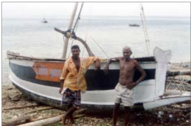
Figure 3. Canoe builder and Normanby-based buyer. (M. Smaalders 1997)