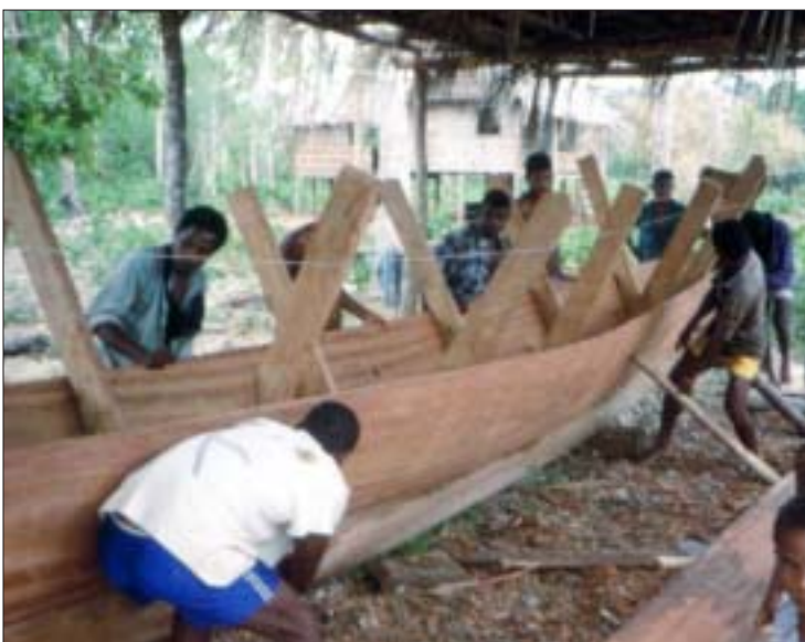
Figure 7. Keel log with frames attached, and first plank being fitted. (M. Smaalders 1997)