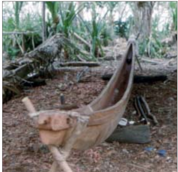
Figure 6. Hollowed-out keel log. (M. Smaalders 1997)

The canoes are rigged with a dipping-lug sail, using bamboo for the boom and yard (Fig. 10). The sails are made from a variety of materials: plastic sheeting, tarps and old Dacron yacht sails (obtained through exchange with visiting yachts) are all common (pers. obs.). The dipping-lug rig was apparently inspired by Australian pearl lug-