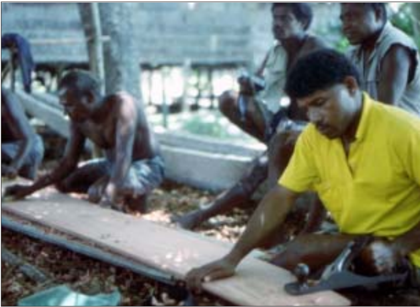
Figure 9. Final smoothing of hull planks with hand planes. (M. Smaalders 1997)