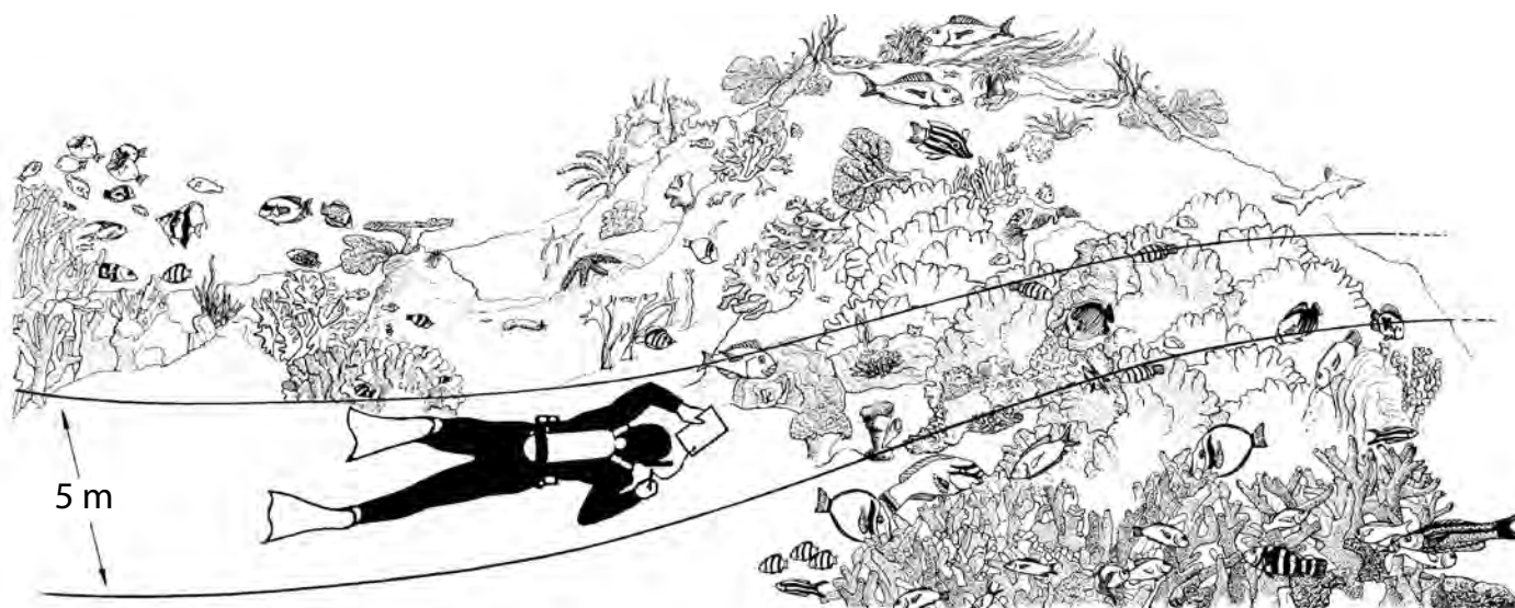
A fisheries scientist swimming along a transect and counting the numbers of different species within a 5 m wide band over a coral reef. From King M. 2007. Fisheries biology, assessment and management. UK, Oxford: Wiley-Blackwell. 400 p.

To assess something is to examine its status or standing at a given time. In fisheries assessment we are gathering information on the status or health of a fish stock or fishery.* This assessment is used to provide fisheries managers with information that they can use to manage a fish stock.