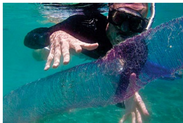
Figure 5. A diamondback squid egg mass at Madang in Papua New Guinea (source: https://morealtitude.wordpress.com/2008/10/13/ , downloaded on Thursday 17 July 2014).