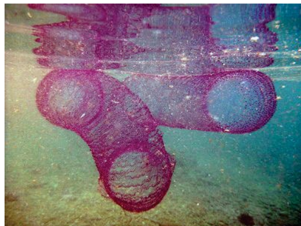
Figure 4. First sighting of a diamondback squid egg mass at Havannah Harbour on Efate, Vanuatu.