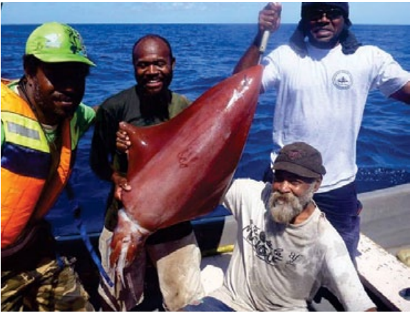
Figure 2. First diamondback squid catch at Aneityum Island, Vanuatu.