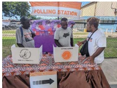
Explaining that every vote is secret