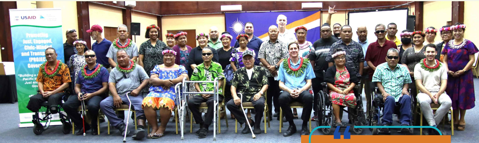
Participants of the Reflections workshop with USAID Charge d'affaires, Lance Posey