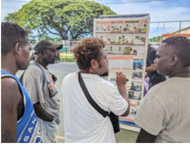
Explaining voting steps