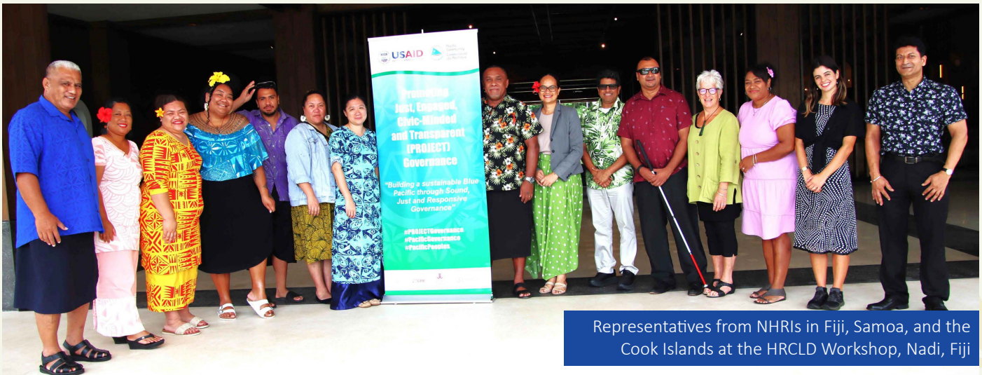
Representatives from NHRIs in Fiji, Samoa, and the Cook Islands at the HRCLD Workshop, Nadi, Fiji