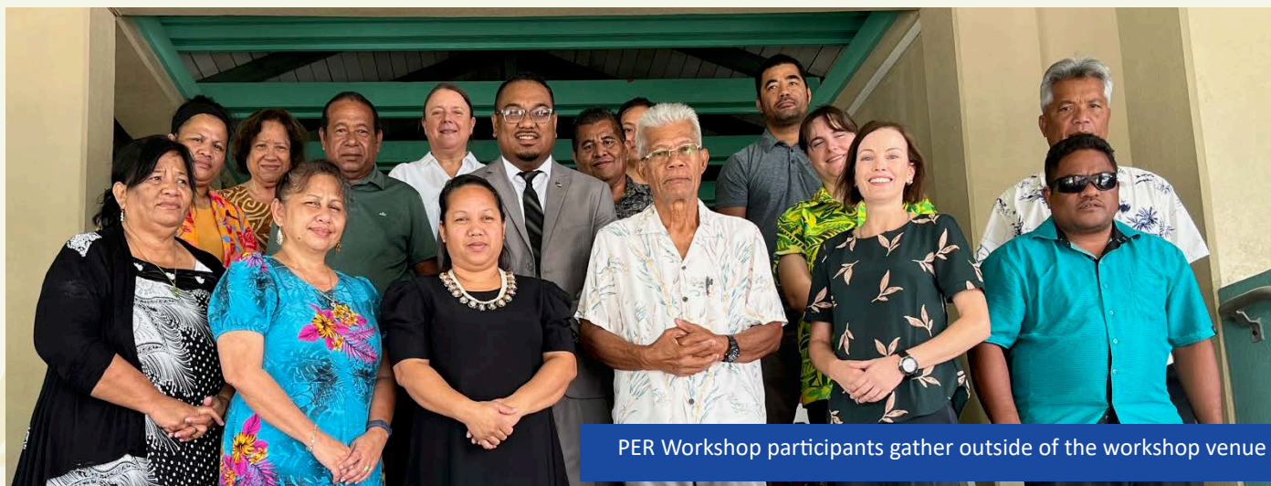
PER Workshop participants gather outside of the workshop venue