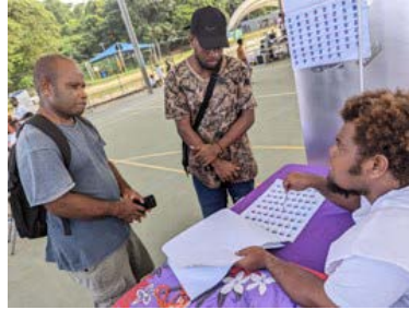
Checking your name on the voter list