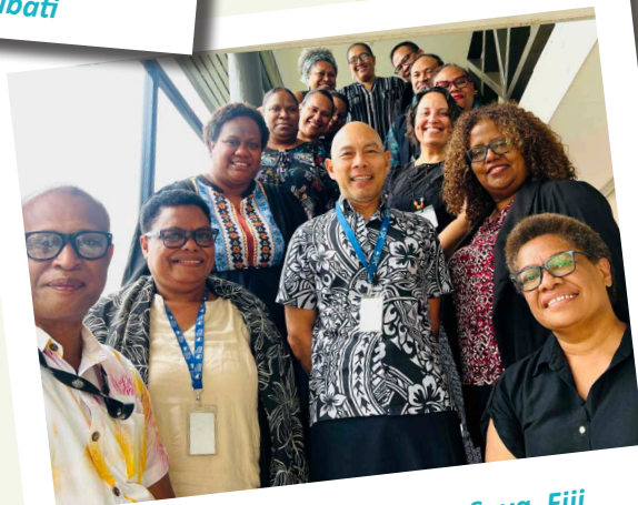
HRSD Donor Roundtable, Suva, Fiji