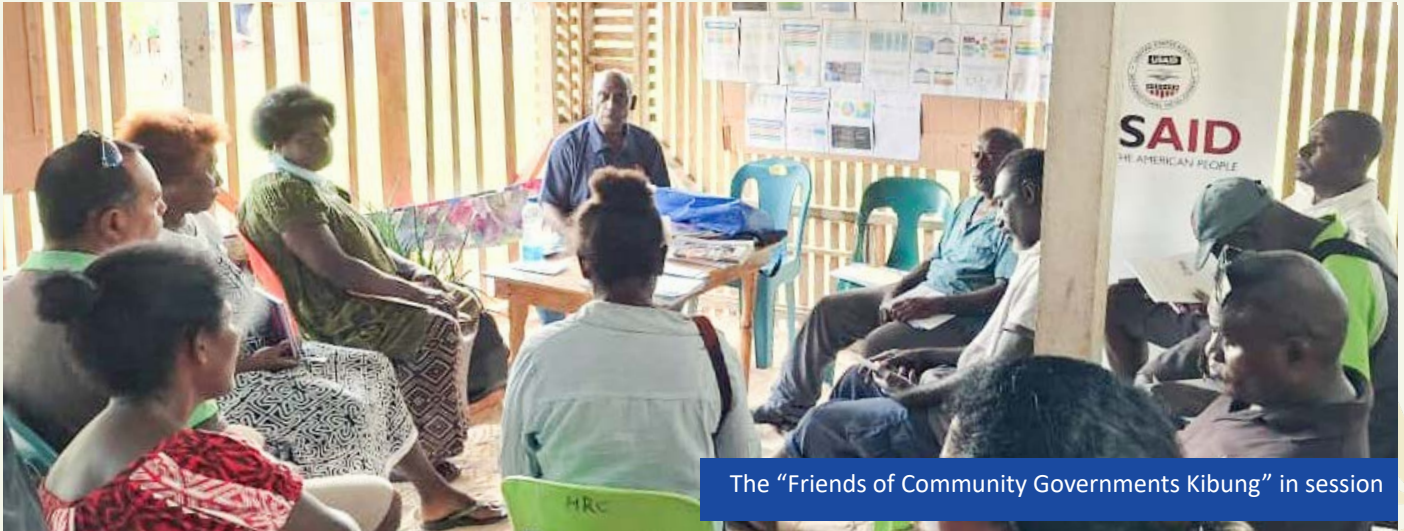
The “Friends of Community Governments Kibung” in session