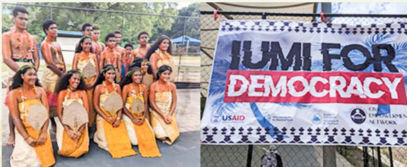
The Tikopia Cultural Dancers and Banner for the Youth Democracy Festival