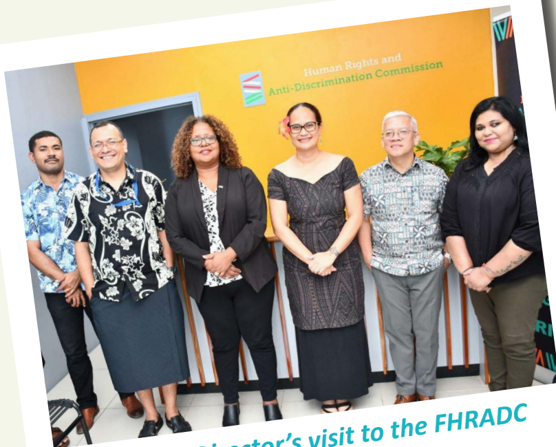
Mission Director's visit to the FHRADC Lautoka Office