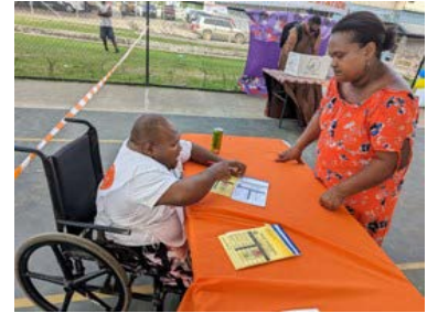
Issuing two ballots in a joint election