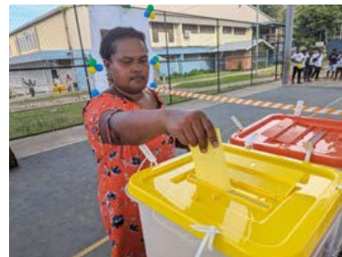
Putting the right color ballot in the right box

To help design content for the Facebook page, UME4Democracy, IFES had a design session on December 5, 2023 with 17 youth (six women, one person with a disability) to create a network name, logo, slogan and develop some key messages.