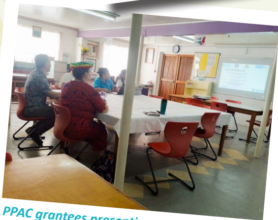
PPAC grantees presenting to US Ambassador during her mission to Kiribati