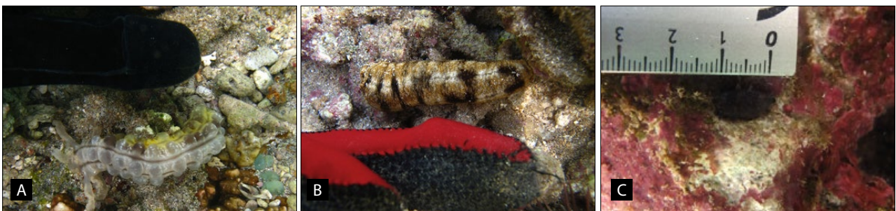
Figure 3. Juveniles of the family Synaptidae (A: Euapta godeffroyi ; B: Synapta maculata ), and Sclerodactylidae (C: Afrocumis africana ).

Most observations were done in areas with strong hydrodynamic conditions where juveniles are usually hidden under small dead coral blocks. More sampling efforts in similar areas should provide valuable information about the early days of the reef life of many tropical sea cucumber species.