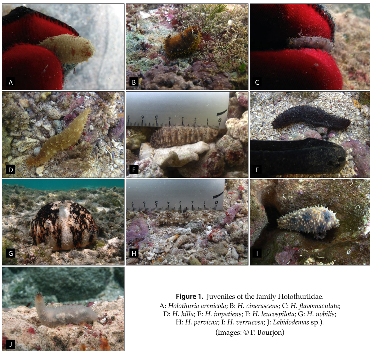
Figure 1. Juveniles of the family Holothuriidae.

* C = contracted, HC = half-contracted, R = relaxed