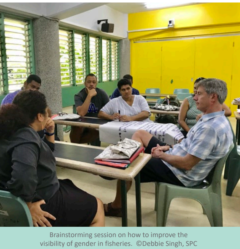
Brainstorming session on how to improve the visibility of gender in fisheries.

A holistic approach is required to ensure PEUMP addresses cross-cutting topics on poverty reduction, social inclusion, equal access and benefits for women and men including HRBA, and participation for youth and marginalised groups. PEUMP therefore has an emphasis on the need to mainstream gender, social inclusion and HRBA in its design, implementation and outcomes.