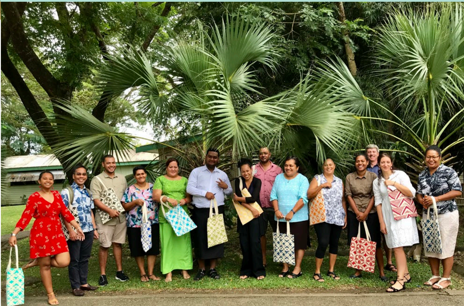
Participants to the three-day workshop on gender equity and social inclusion and human rights-based approaches, USP, June 2019.