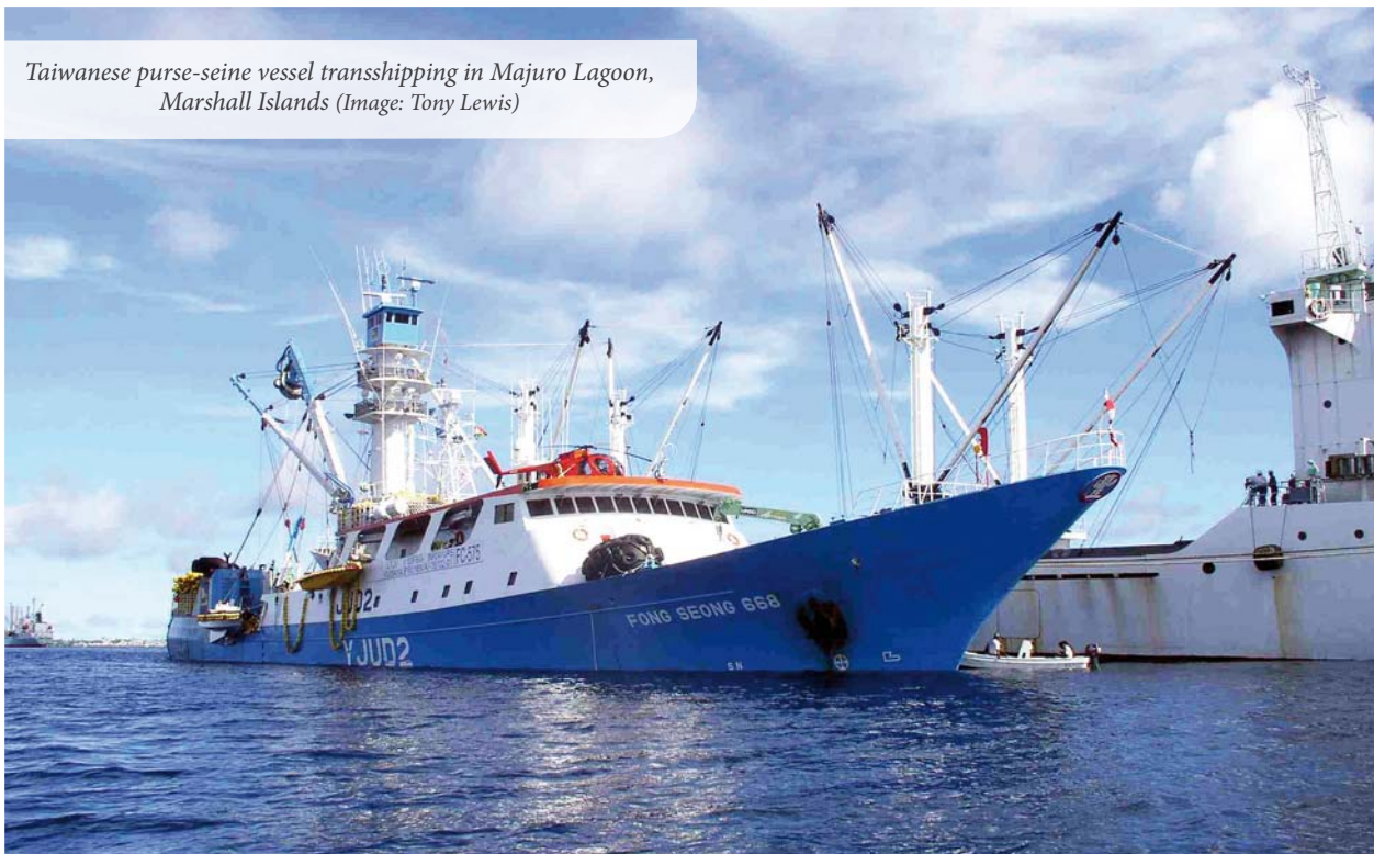
Taiwanese purse-seine vessel transshipping in Majuro Lagoon, Marshall Islands

The report can be downloaded from: http://www.ffa.int/node/567