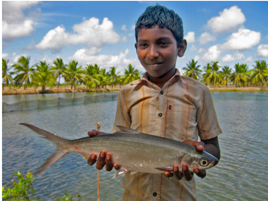
A boy with a milkfish, Chanos chanos .