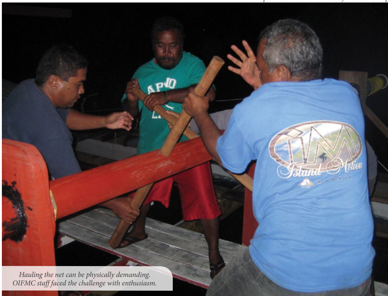
Hauling the net can be physically demanding. OIFMC staff faced the challenge with enthusiasm.