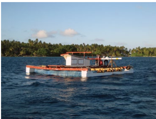
The bagan anchored for the first fishing trials.

The project began in October 2011 when the bagan was constructed in Kiribati and transported to Majuro for assembly. The bagan was launched in February 2012 and two Indonesian consultants (a pole-and-line specialist and a bagan operations specialist) were engaged to conduct fishing and value-adding demonstrations for eight days in March.