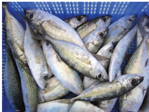
Scads and mackerel caught on the first fishing trial.

The catch mainly comprised sardines, scads and mackerel.