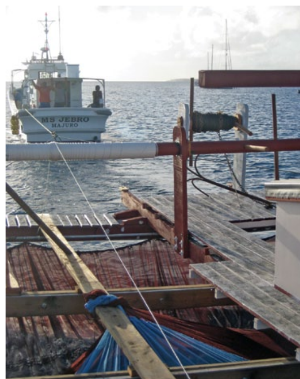
Towing the bagan to the fishing location.