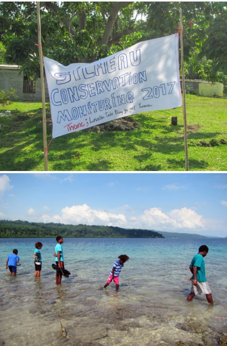
Figure 5. Community monitoring days demonstrating the utility of the Toolkit methods and the awareness raising benefits.