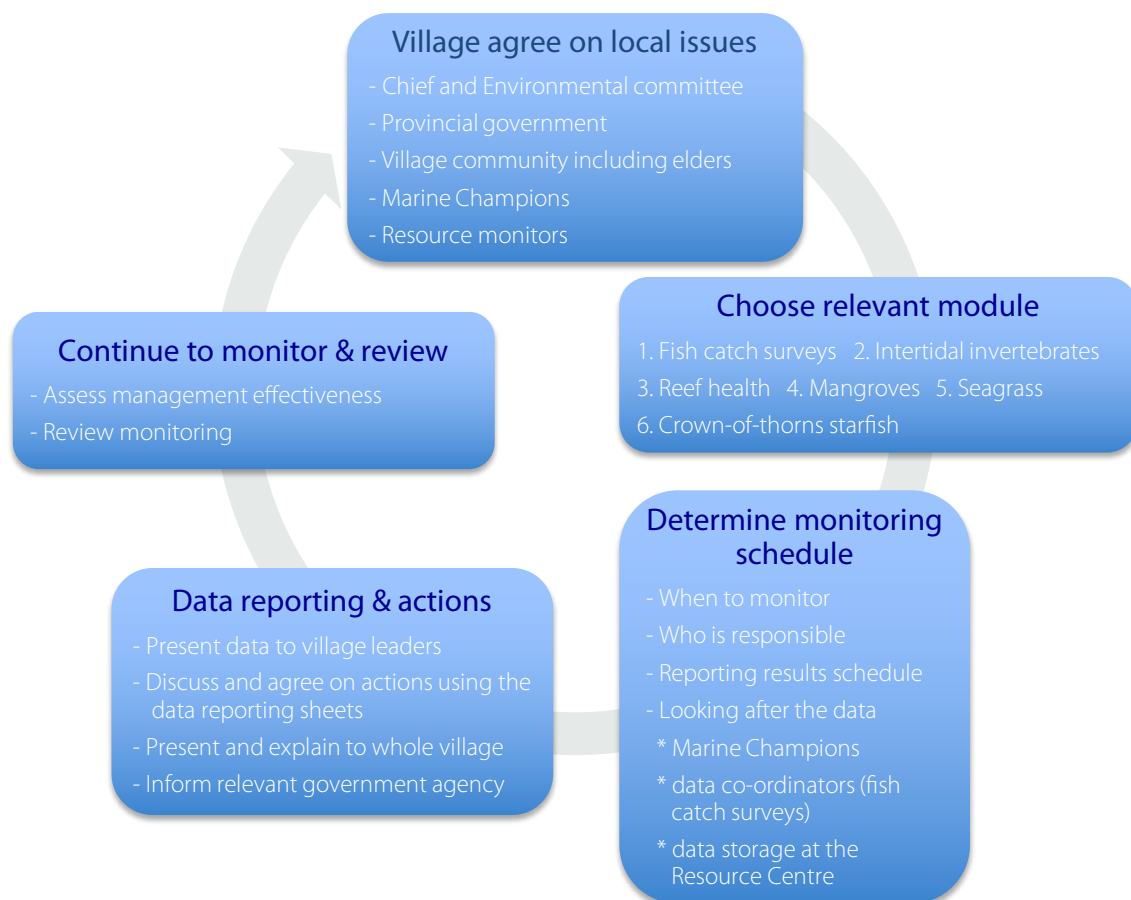
Figure 1. Diagram of the monitoring, review and management process.

The Toolkit provides information that can be used by government to inform national initiatives. For example, the catch surveys focus on subsistence catch, which fills a national (and regional) data gap, and complements national