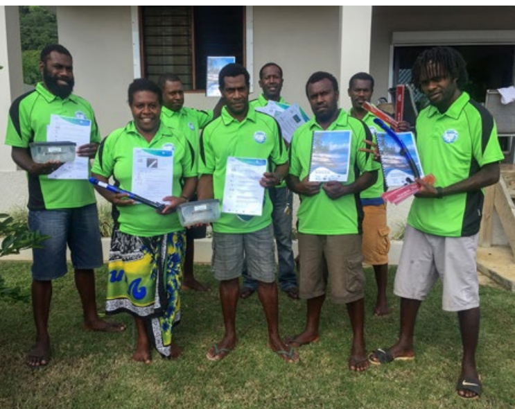
Figure 2. Some of the Vanuatu Marine Champions who are all trained in the six Toolkit modules and lead community training and monitoring sessions.

data monitoring of commercial catches. The catch surveys also focus on size data to inform community decision-making while also collecting catch per unit effort (CPUE) data that provide a long-term data set that is compatible with VFD requirements. Also, the mangrove and seagrass surveys adopt nationally used methods, and the crown-of-thorn starfish (COTS) module links directly with a current national initiative.