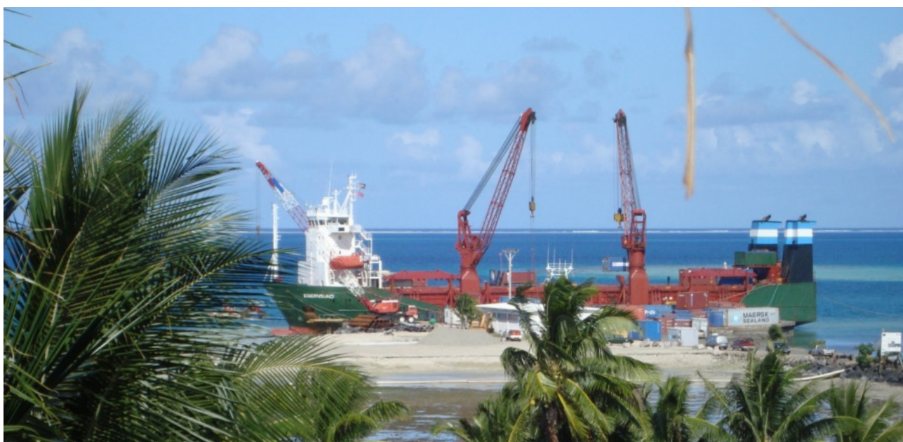
Vessel unloading goods at Mata-Utu, Wallis and Futuna.

for research to better understand how food and beverage trade can better serve PICTs. The PFTD will be updated from time to time as new data from Comtrade and BACI become available and on the ad hoc advice of regional and national experts as errors are identified. The PFTD was developed as a research tool and does not constitute an official record of trade flows among countries in the Pacific region.