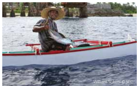
William Sokimi © SPC