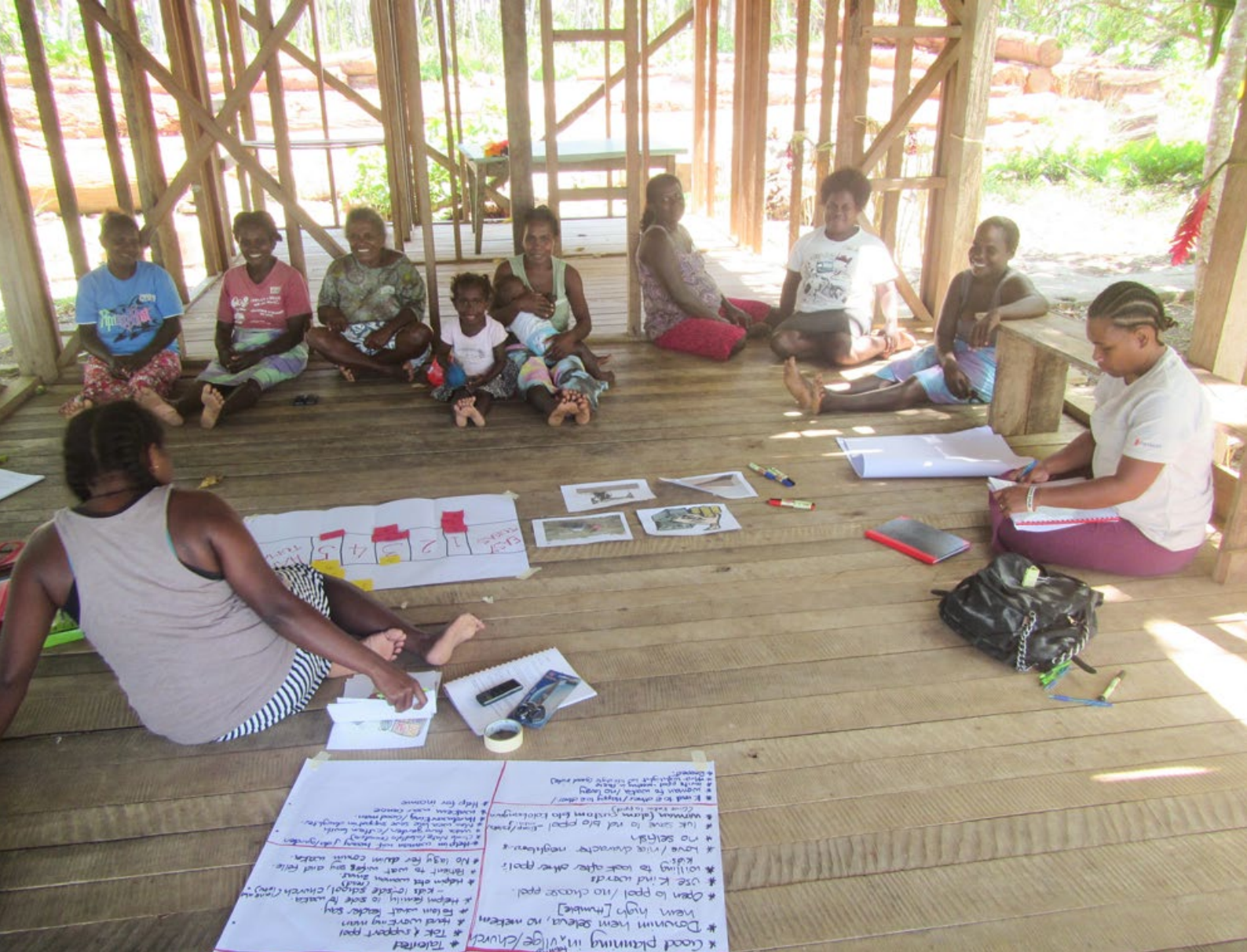
Women's focus group discussion, Solomon Islands.

barriers, which mean that current efforts may not be appropriate for adequately addressing inequalities in SSF.