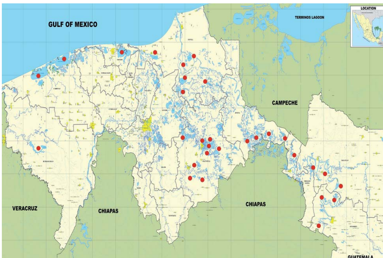
Figure 1. The State of Tabasco in the southeastern part of Mexico and the locations where lagoons and water bodies were sampled for freshwater bivalves (marked with red dots).