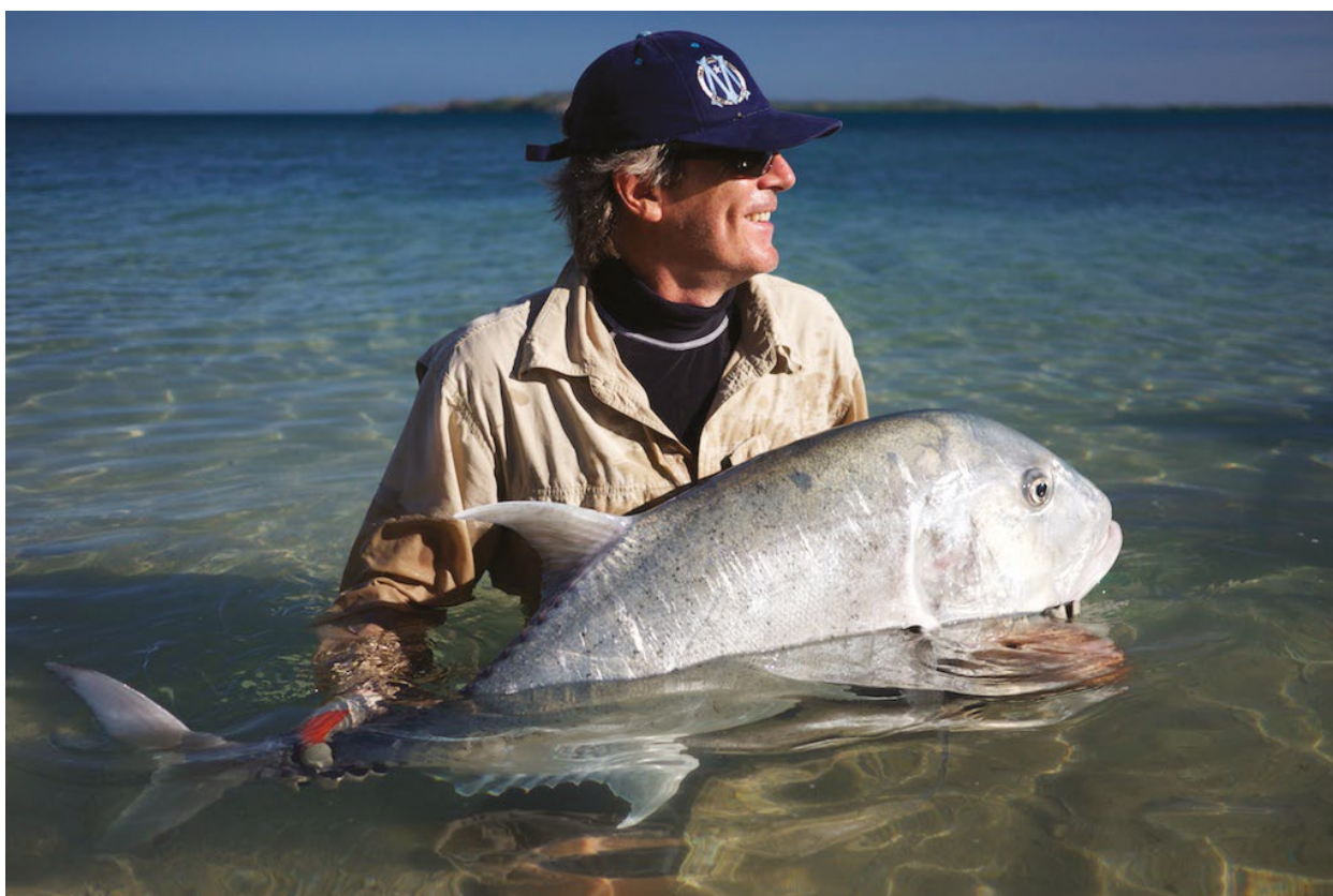
The giant trevally is, as bonefish, an iconic species that draws anglers to New Caledonia.

Seidel and Lal (2010) take a slightly different approach to calculating the numbers of jobs created or supported. They estimate the number of people directly employed by the tourist business, and from this calculate the number of jobs that exist elsewhere in the economy. They conclude that for one person employed in the tourist industry approximately three jobs exist elsewhere in the economy, with an estimated economic multiplier that ranges between 2.59 and 3.80.