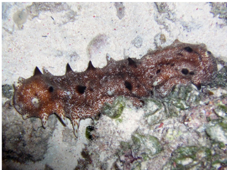
Figure 2. Australostichopus mollis observed moving on the reef surface at night at Elizabeth Reef, Australia.

oocytes are swept away from the benthos where they could otherwise be eaten.