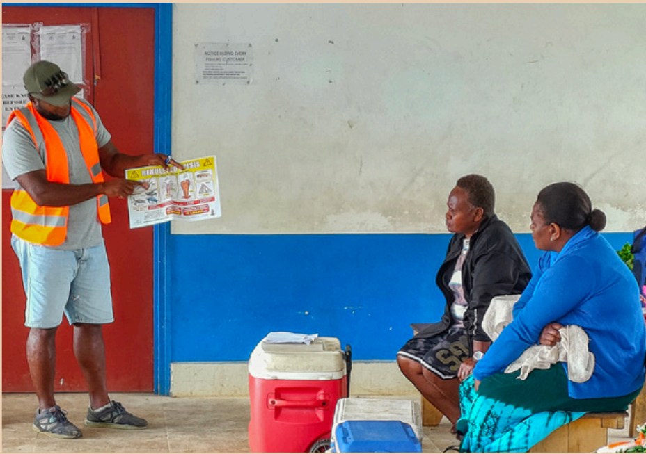
Field work included visits and controls at fish selling locations.