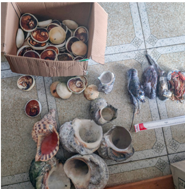
Illegal confiscated product taken from markets in Port Vila.