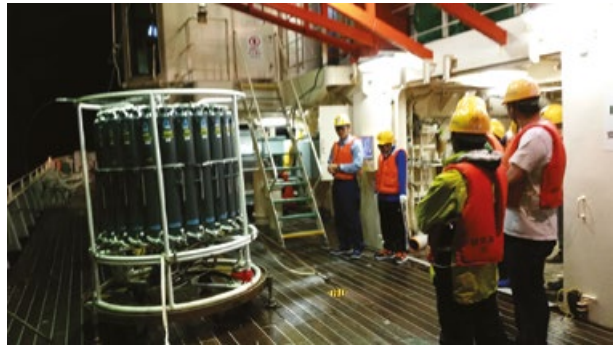
Work on deck to deploy the sampling gear continued day and night. This is the CTD with Niskin bottles, about to be lowered to 1000 m depth.