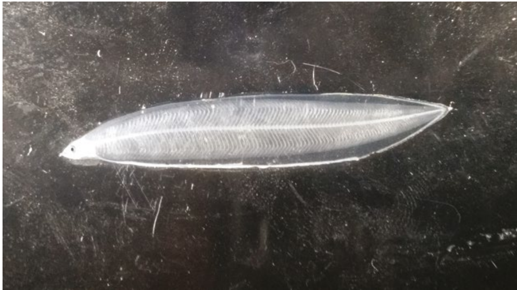
Freshwater eel leptocephalus larva caught in the oceanic waters north of Fiji.