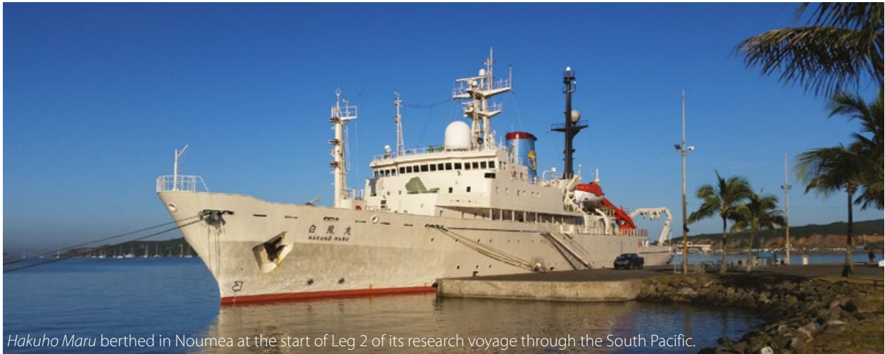
Hakuho Maru berthed in Noumea at the start of Leg 2 of its research voyage through the South Pacific.