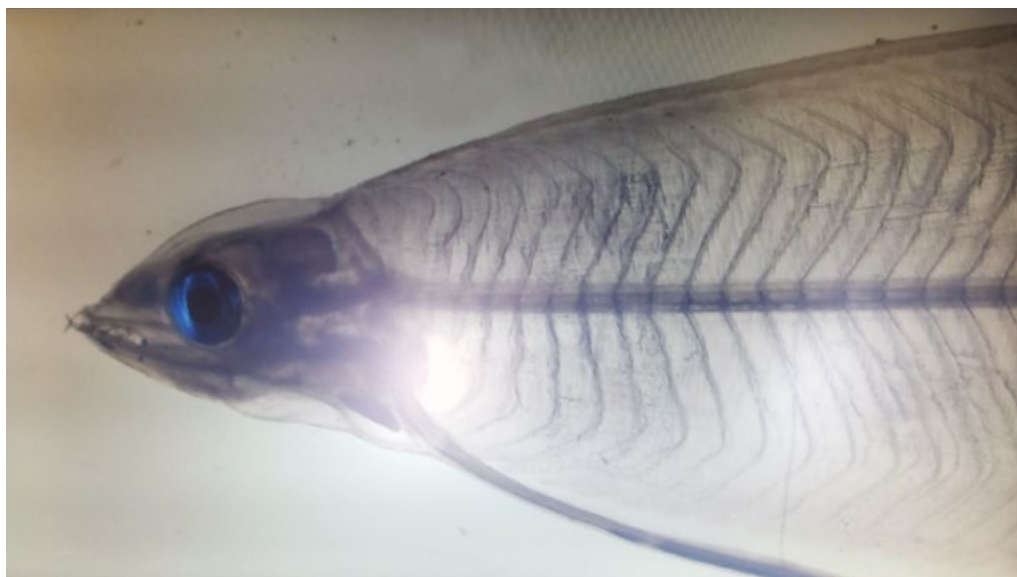
Close-up of the head of a freshwater eel larva.