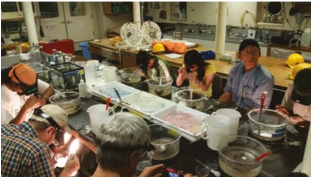
Leptocephalus larvae hunt. Each plankton haul has to be carefully examined by the scientific team to find the transparent, ribbon like eel leptocephalus larvae among all the other sea creatures in the plankton catch.