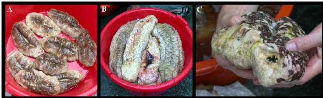
Figure 3. Freshly gutted specimens of A) Holothuria (Microthele) fuscogilva Cherbonnier, 1980; B) Thelenota anax Clark, 1921; and C) an as yet undescribed color morph of Holothuria (Microthele) nobilis (Selenka, 1867).

Fortunately, there is some positive news. Chinese fishermen, fully aware of their destructive fishing activities, have recently begun farming some of the high value species. We hope they will be successful in their initiative.