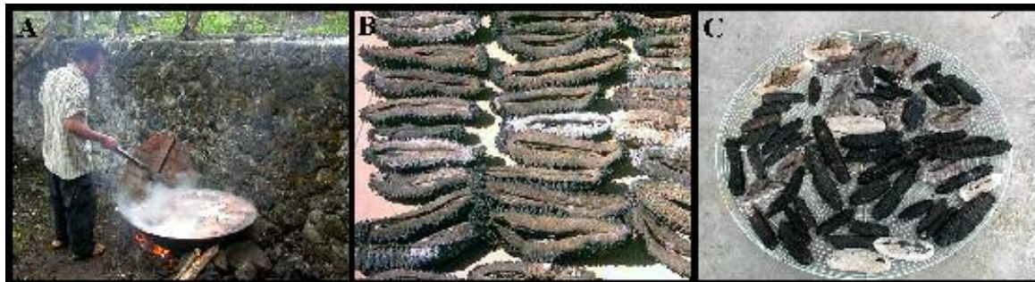
Figure 4. After gutting, specimens are boiled for one hour (A) and dried in the sun (B, C).