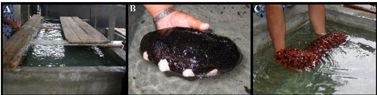
Figure 5. Achieving durability in sea cucumber exploitation through farming initiatives. A) Tank for rearing sea cucumbers; B) Holothuria (Microthele) nobilis (Selenka, 1867); and C) Thelenota ananas (Jaeger, 1833).