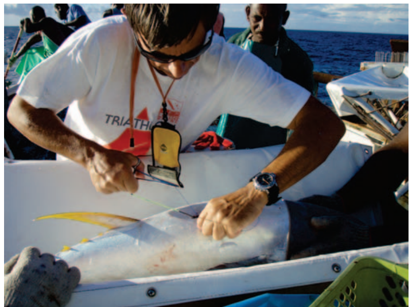
Inserting an archival tag in a yellowfin tuna belly (note the green tag antenna sticking out).