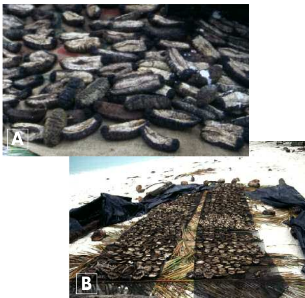
Figure 2. Part of the haul of sea cucumbers on Eagle Island, April, 2006. Although not positively identified, it seems likely that the species include: A: some valuable teat fish Holothuria (nobilis?) and B: probably Actinopyga or Bodaschia spp.

In April 2005, a camp of illegal Sri Lankan fishers was observed on the northern end of Eagle Island, a Strict Nature Reserve. About 10 fishermen were pre-