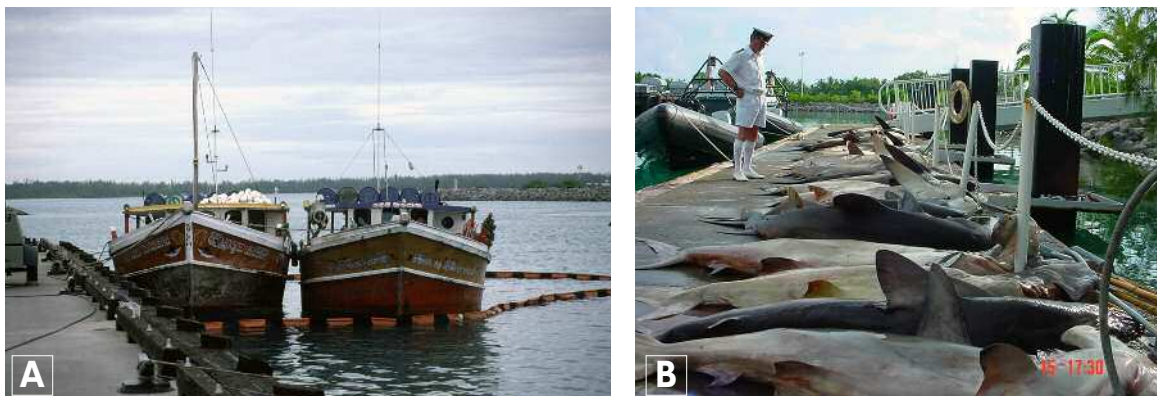
Figure 1. Intercepted illegal fisheries impounded in Diego Garcia. A: Sri Lankan vessels ; B: shark catch