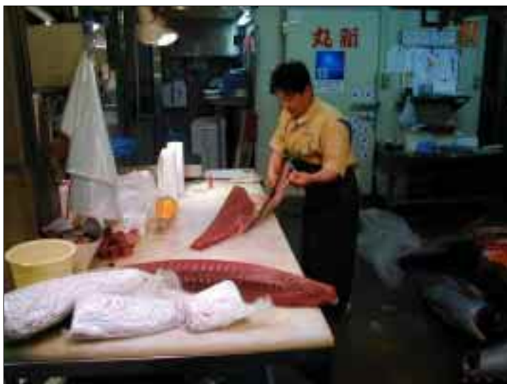
The belly flap is cut from the lower loin