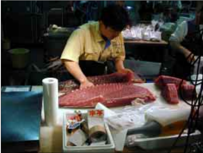
Next the half loin is split into two quarter loins