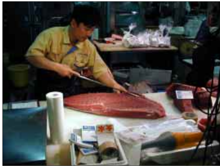
Pin bones and blood line are cut away from these two loins as well