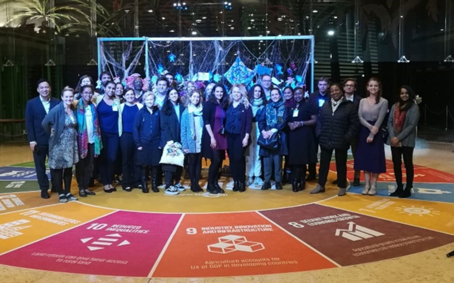
Image 1. Participants of the informal gender gathering at the International Symposium on Fisheries Sustainability.