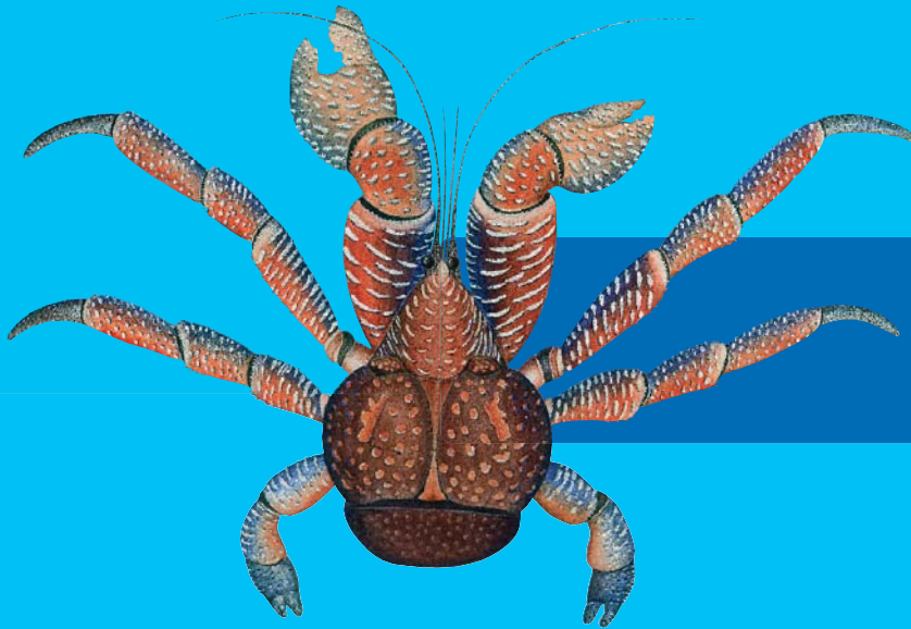
Coconut crab ( Birgus latro )